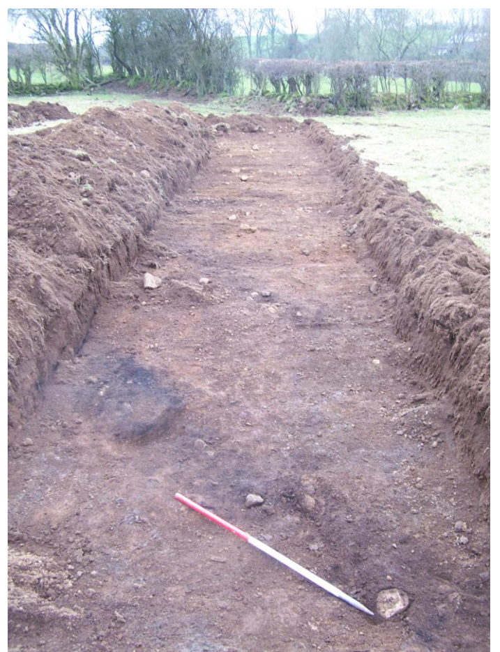
Plate 3: Trench A, Feature 2, looking south-west.