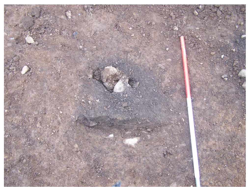
Plate 6: Trench C, Feature 7 (sectioned), looking south-east.