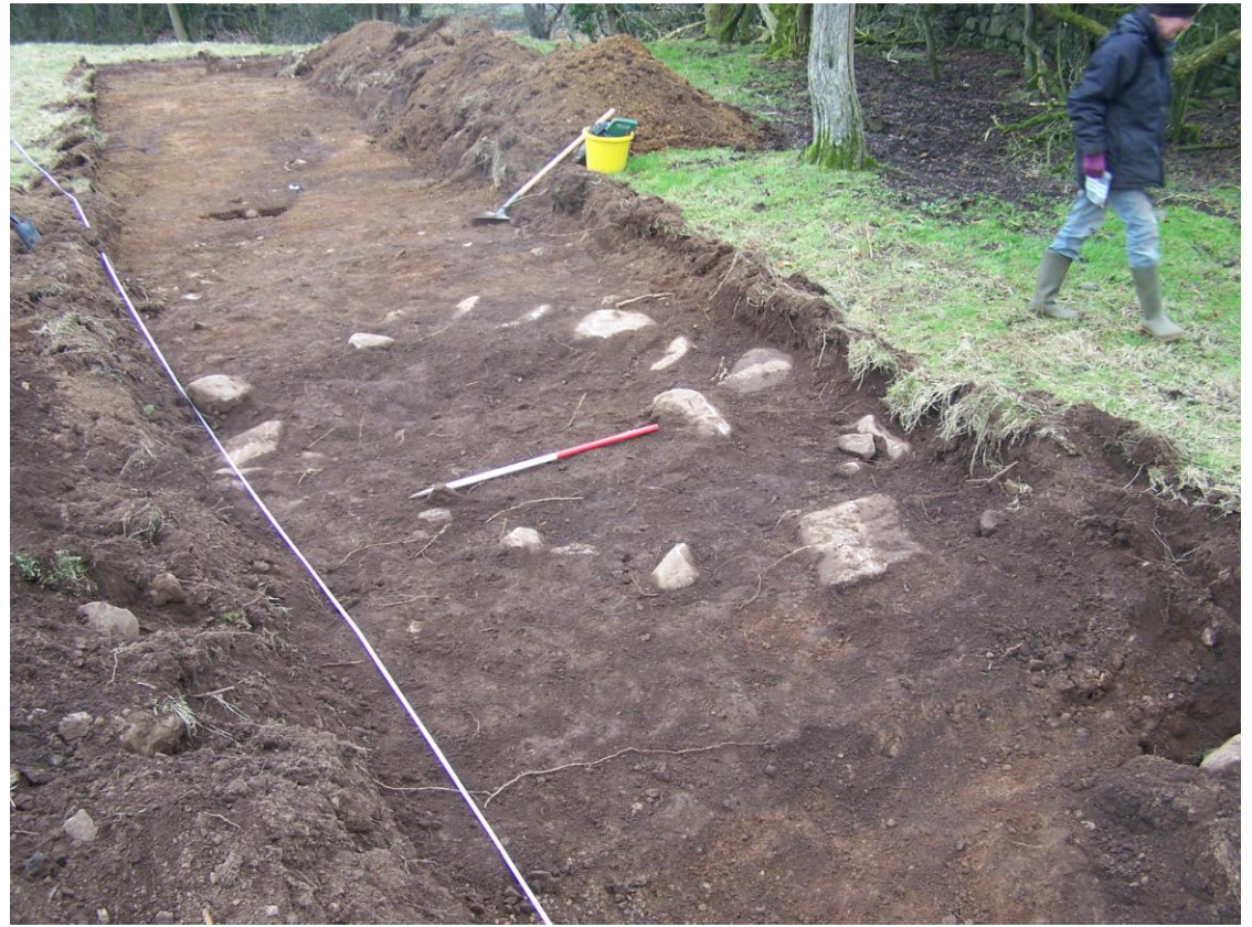
Plate 8: Trench C, Features 9 and 10, looking north-east.