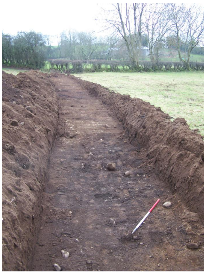
Plate 2: Trench A, Feature 1, looking south-west.