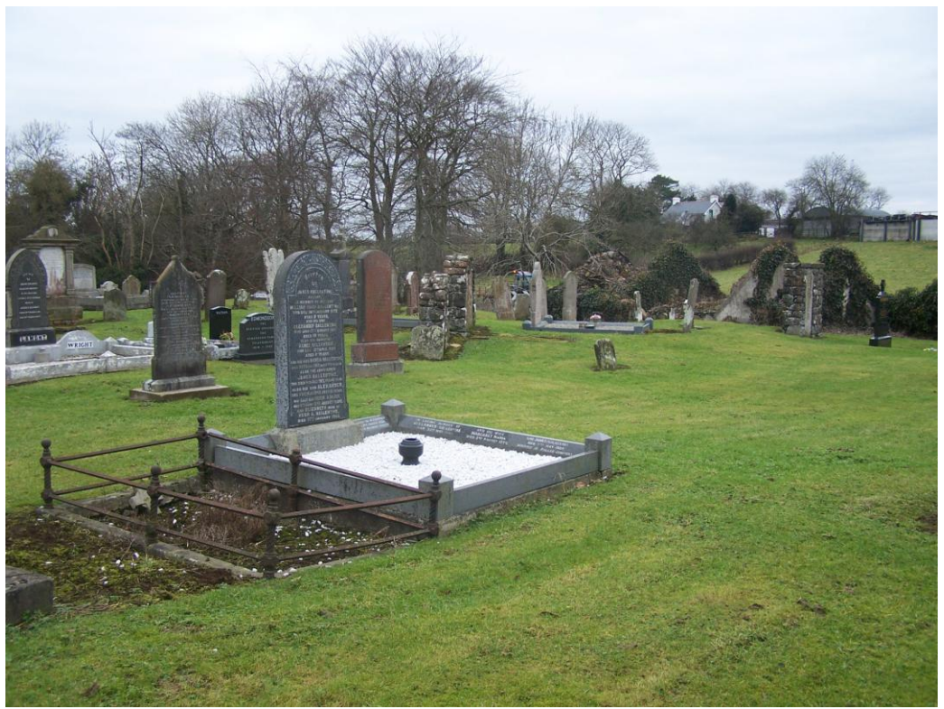
Plate 1: Ballyclug Old Graveyard, and ruinous school-house, looking north-west.