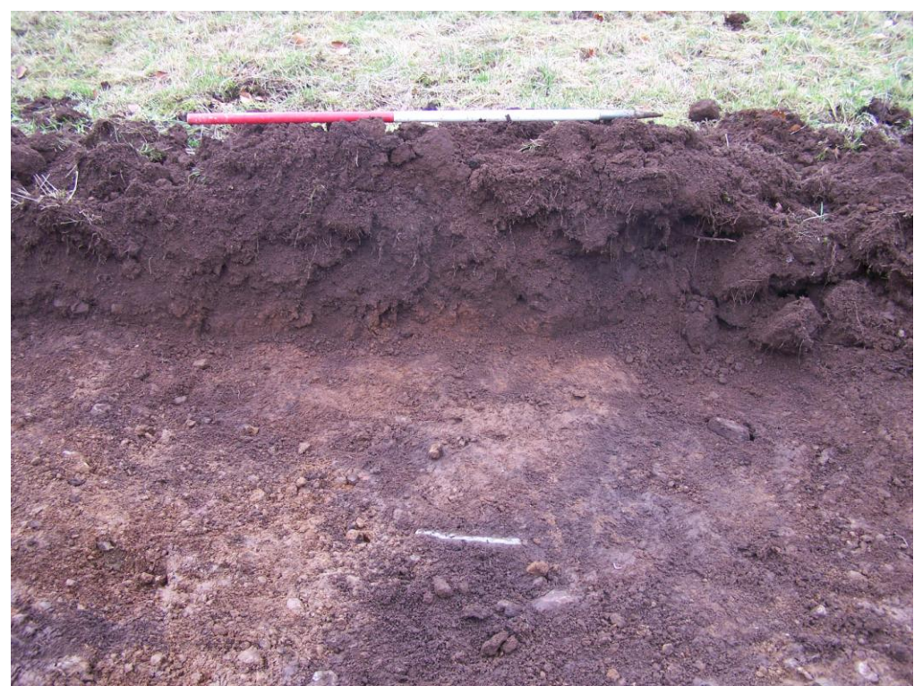
Plate 4: Trench B, Feature 3, looking north-west.