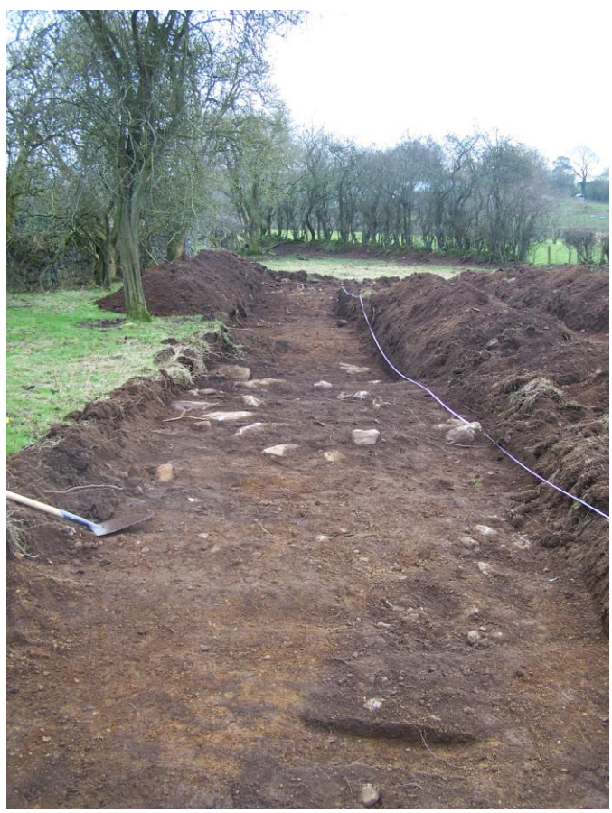
Plate 9: Trench C, showing Features 8, 9 and 10, looking south-west.