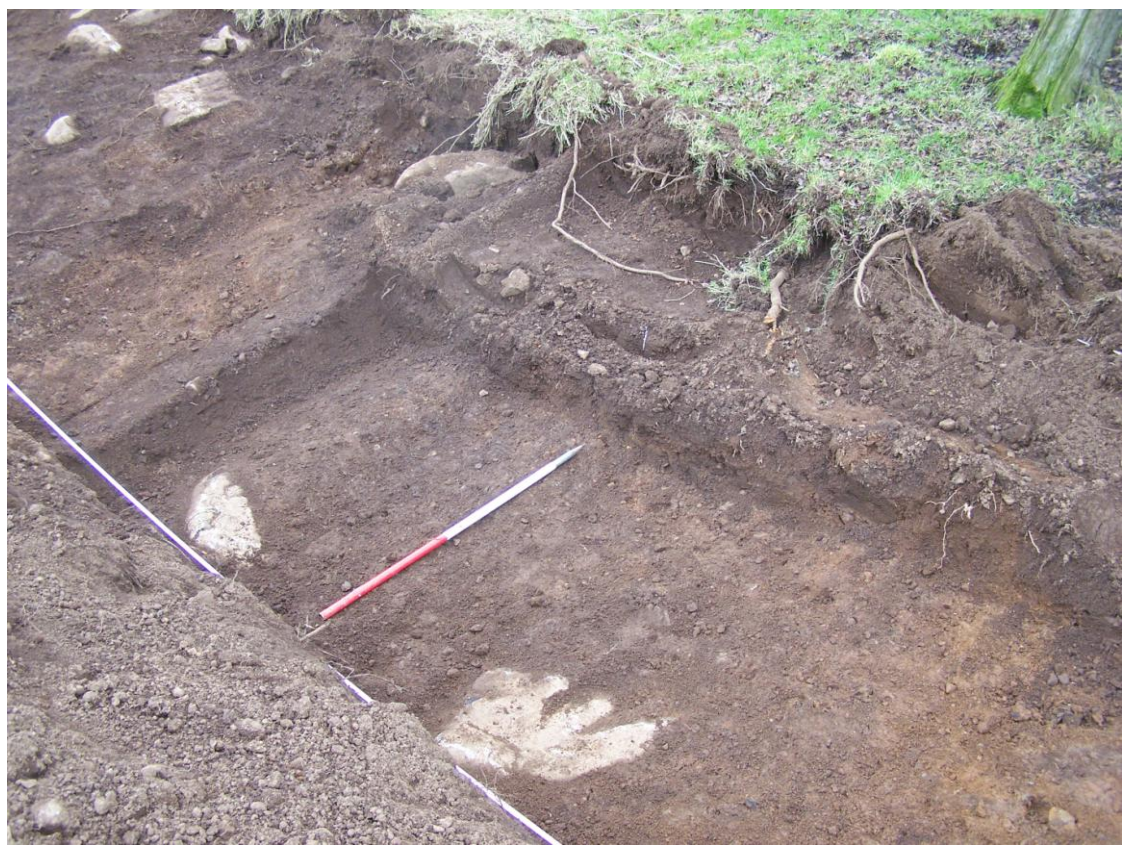
Plate 7: Trench C, Feature 8 and part of 9, looking east.