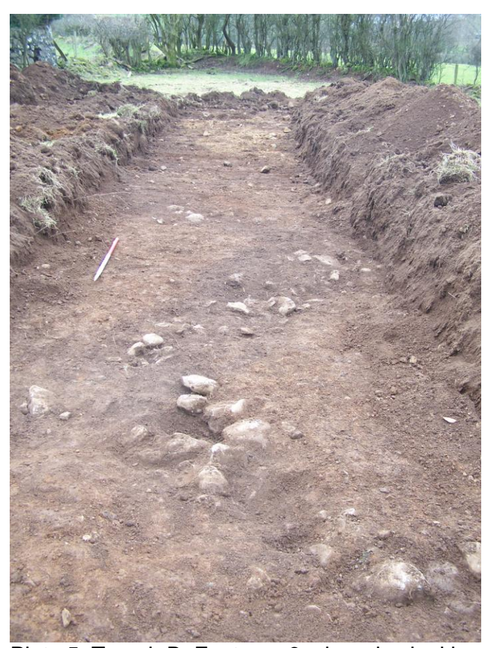
Plate 5: Trench B, Features 6a, b and c, looking south-west.