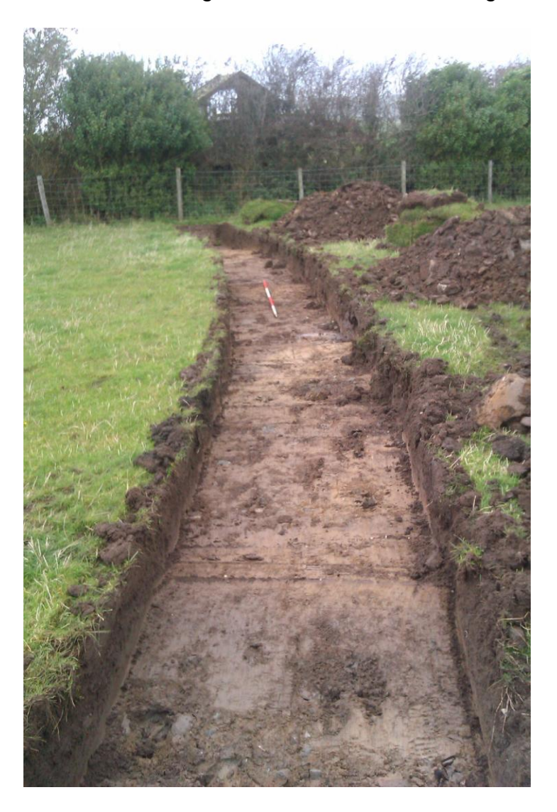
Plate 20: Trench 8 following removal of upper deposits, looking east