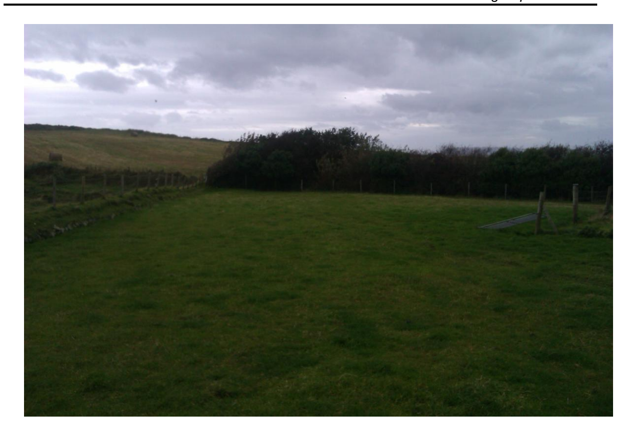
Plate 3: General view of site prior to evaluation, looking north north-east