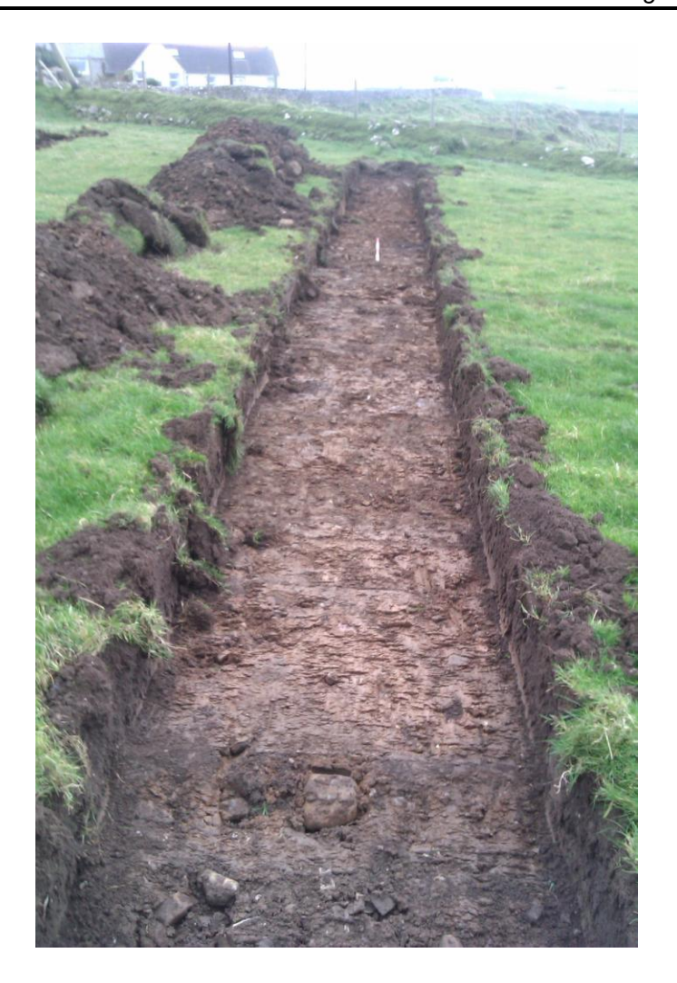
Plate 7: Trench 2 following removal of upper deposits, looking west