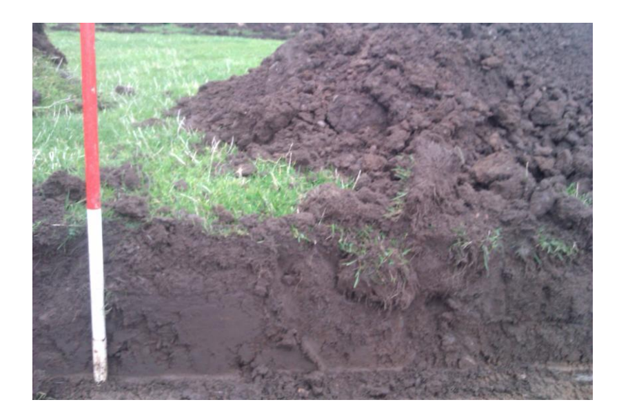
Plate 14: North-facing section of Trench 5, looking south