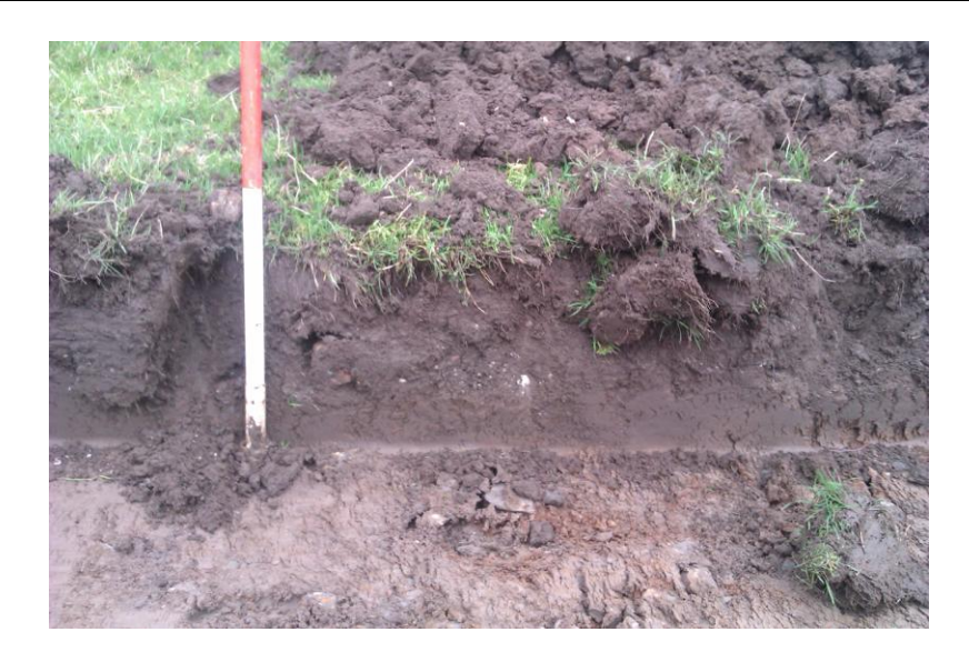
Plate 19: North-facing section of Trench 7, looking south