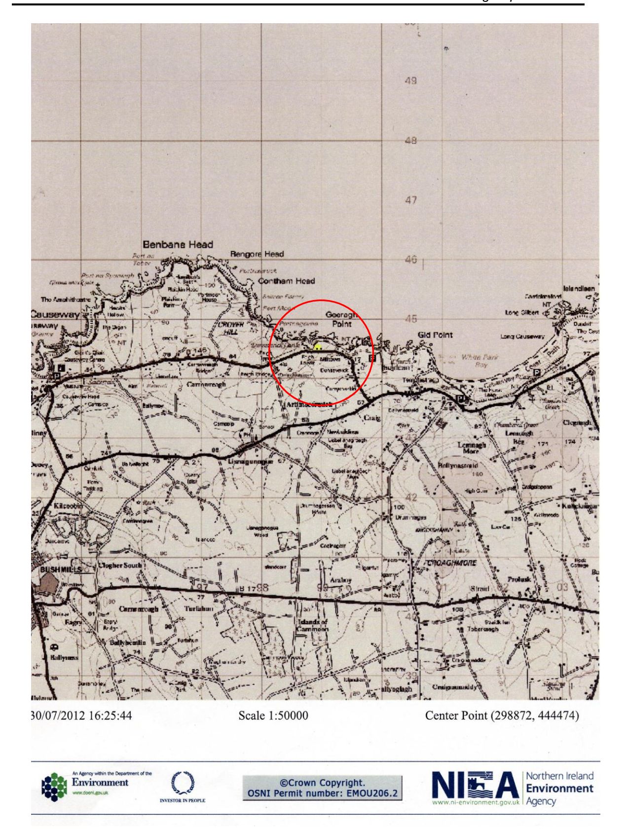
Figure 1: Map showing the location of the site (circled in red)