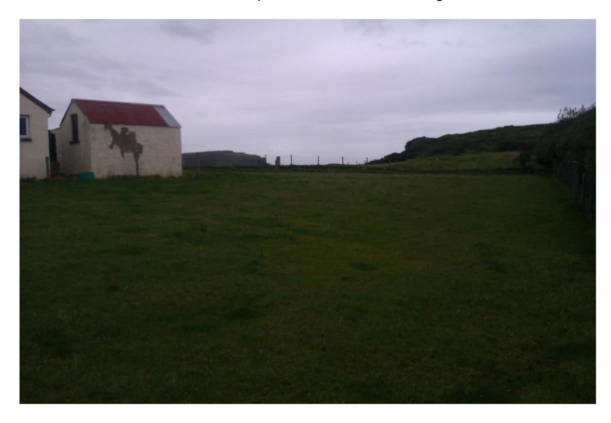
Plate 4: General view of site prior to evaluation, looking north-west