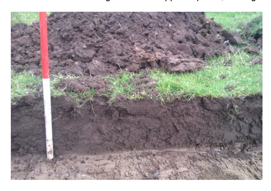
Plate 12: North-facing section of Trench 4, looking south