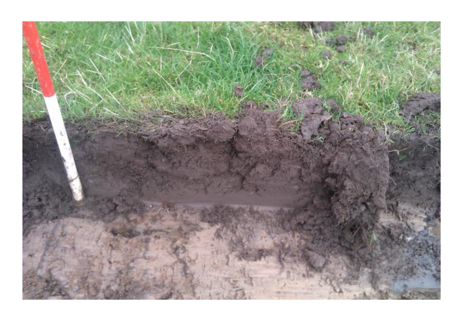
Plate 17: North-facing section of Trench 6, looking south