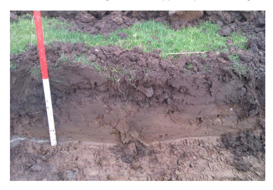
Plate 8: North-facing section of Trench 2, looking south