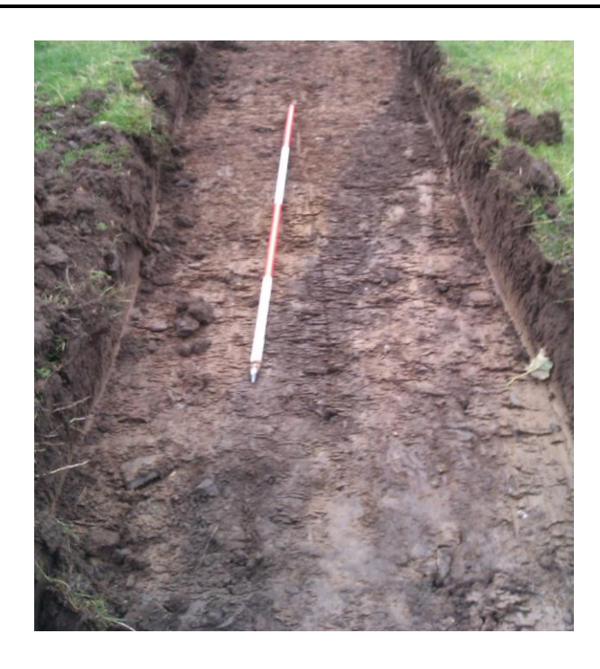
Plate 15: Pipe trench in Trench 5 (C503/504), looking west