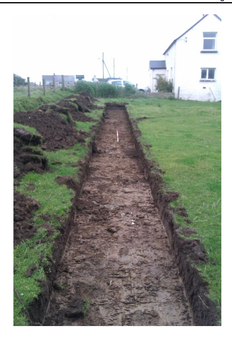
Plate 11: Trench 4 following removal of upper deposits, looking west