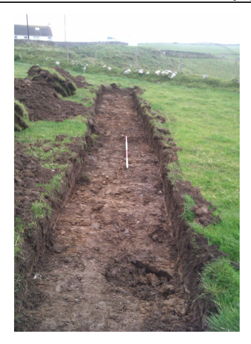
Plate 9: Trench 3 following removal of upper deposits, looking west