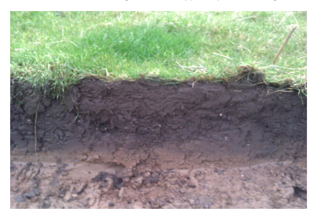
Plate 6: South-facing section of Trench 1, looking north