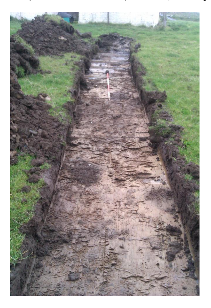
Plate 16: Trench 6 following removal of upper deposits, looking west