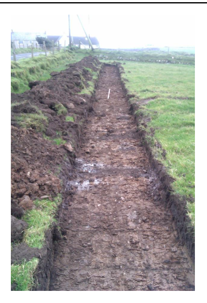
Plate 5: Trench 1 following removal of upper deposits, looking west