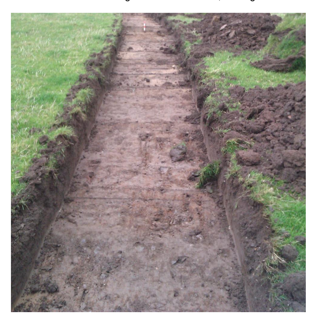
Plate 18: Trench 7 following removal of upper deposits, looking east