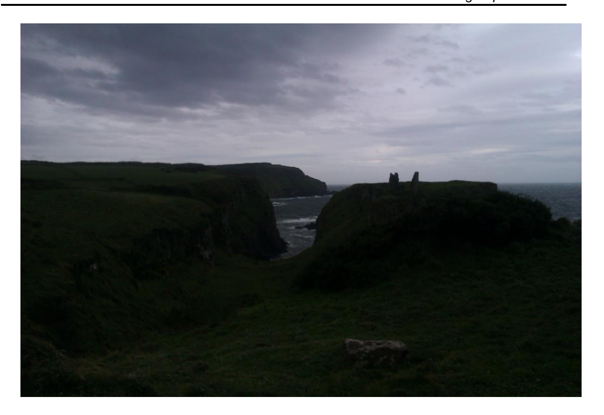
Plate 1: Dunseverick Castle (ANT 003:011), looking north-west