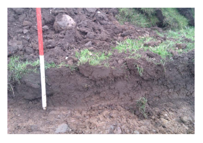
Plate 10: North-facing section of Trench 3, looking south