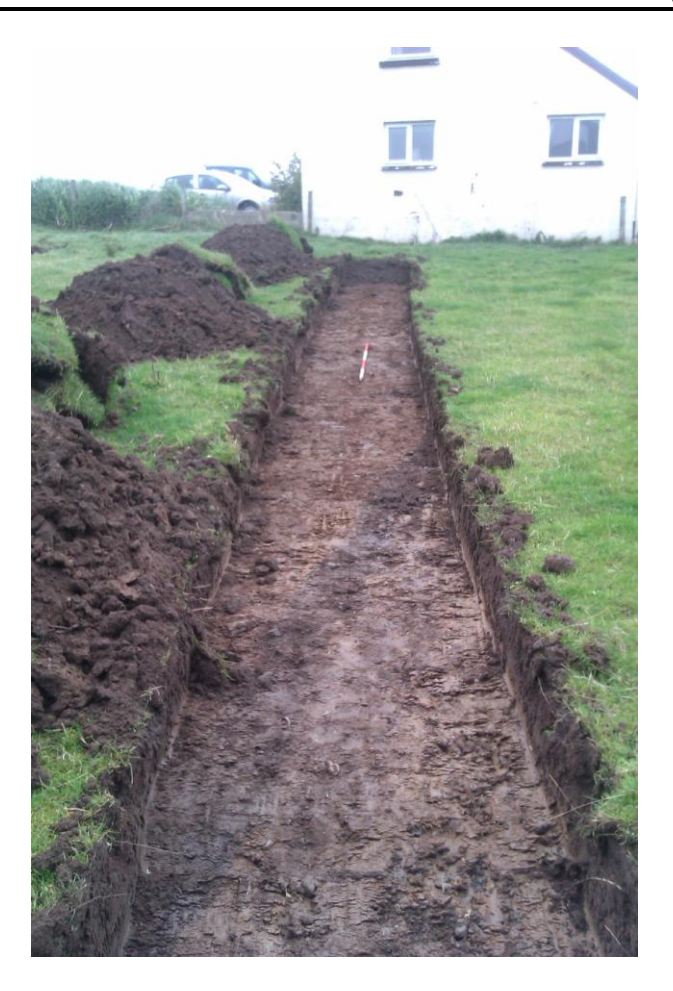
Plate 13: Trench 5 following removal of upper deposits, looking west