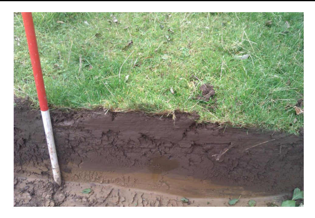
Plate 21: South-facing section of Trench 8, looking north