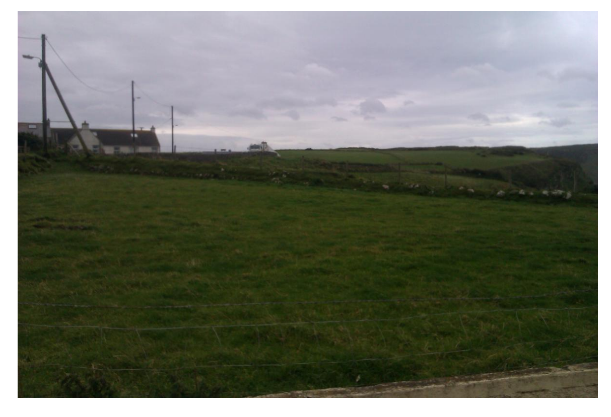
Plate 2: General view of site prior to evaluation, looking west