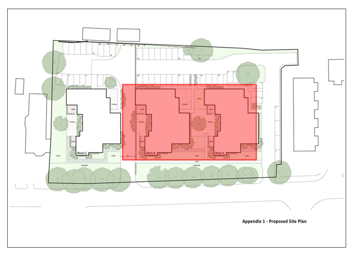
Figure 2: Phase Two of archaeological monitoring - area subject to archaeological evaluation shaded in red.