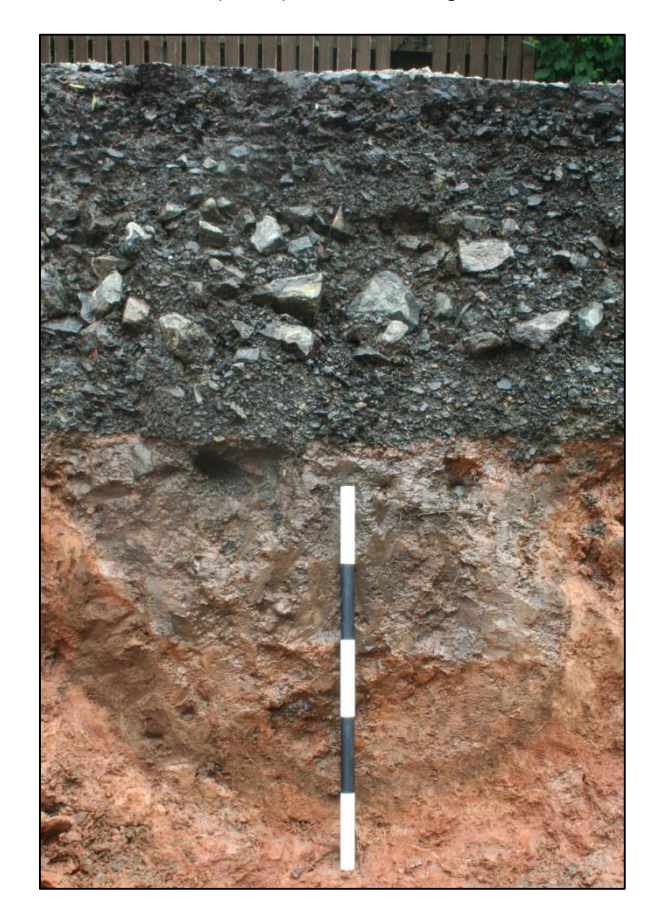
Plate 4: Pit feature (1003) showing levelled surface of the subsoil and associated road deposits.