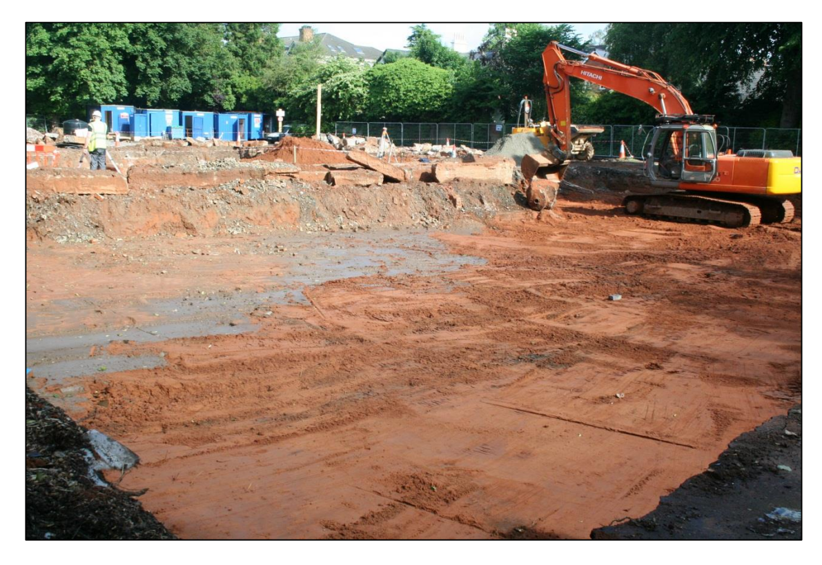
Plate 2: Levelled subsoil surface in Block A (variation in colour is due to lying water)