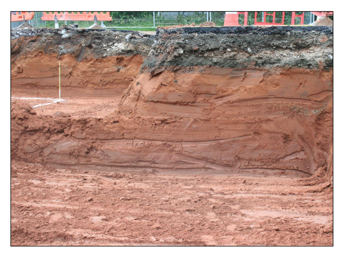
Plate 1: South facing section of Block B showing slight variation in subsoil