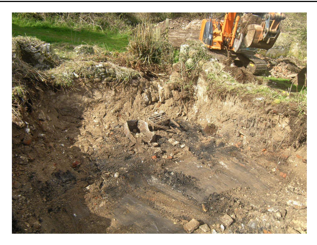
Plate 05: North-east room after removal of rubble, looking north, showing remains of iron fire grate