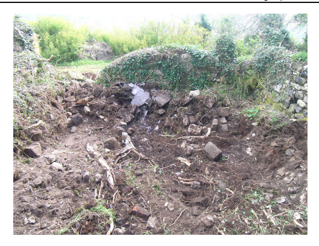
Plate 03: South-west room after removal of rubble, looking south