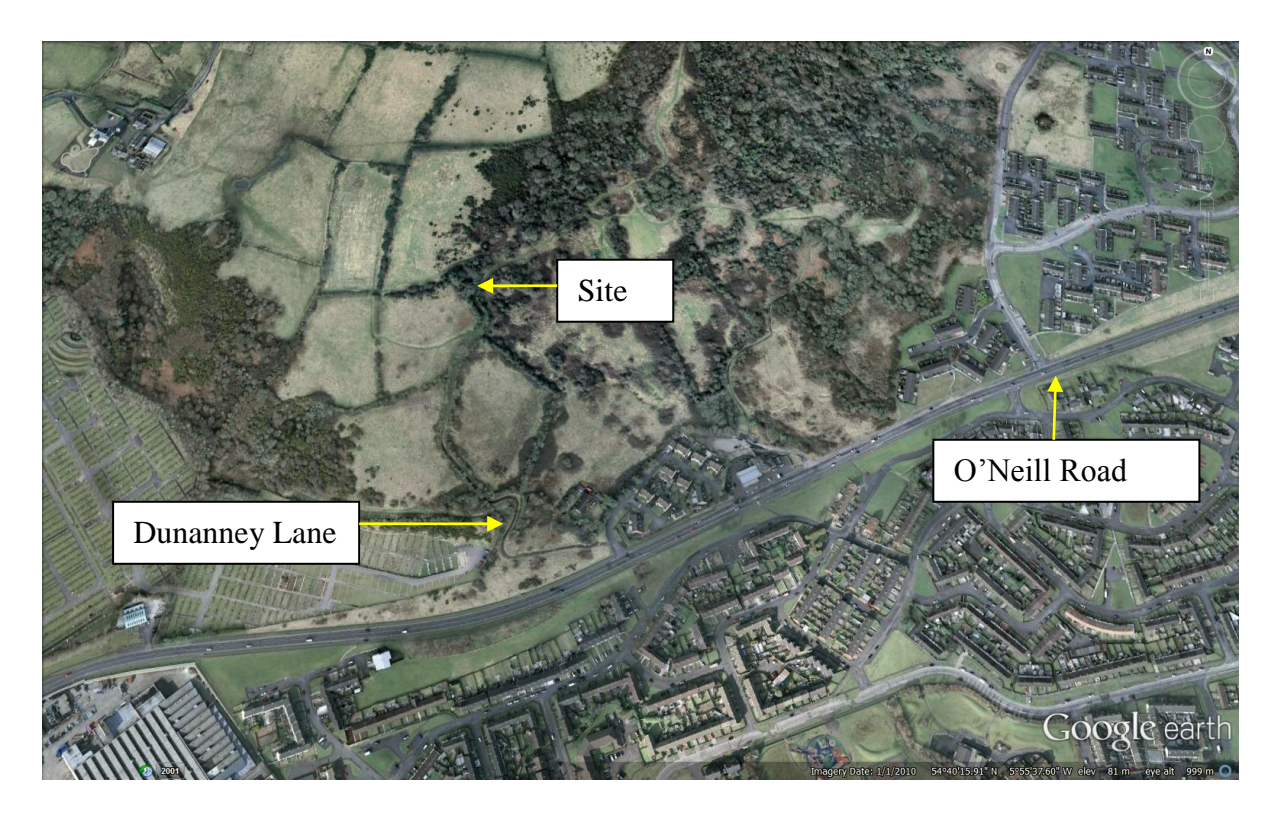
Figure 01: Aerial photograph showing location of site Google Earth