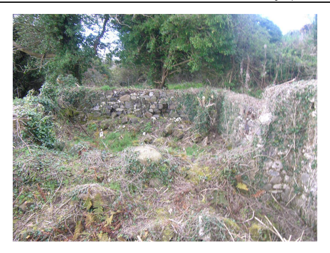
Plate 01: View of building remains before removal of rubble, looking southwest