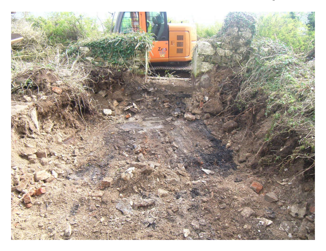
Plate 04: Centre room after removal of rubble, looking south