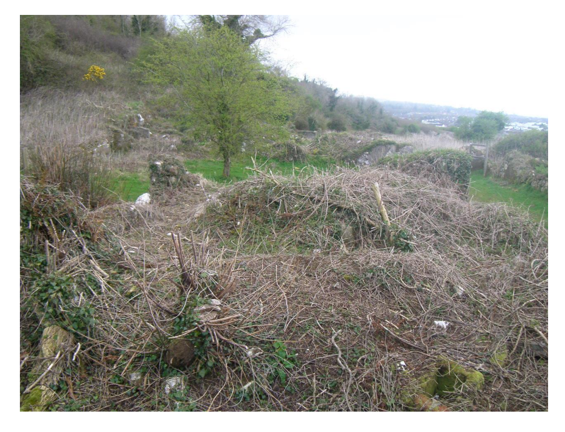
Plate 02: View of building remains before removal of rubble, looking northeast