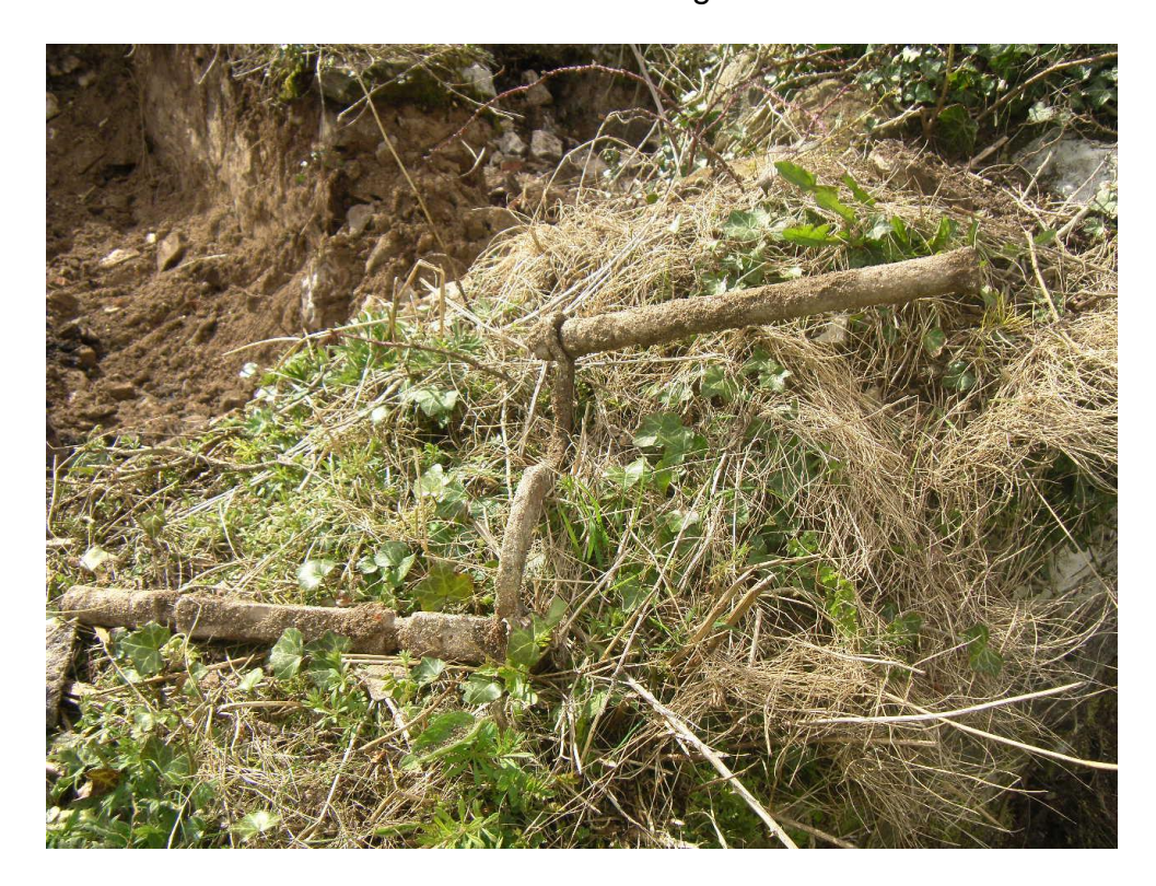
Plate 06: Iron winding handle recovered from north-east room