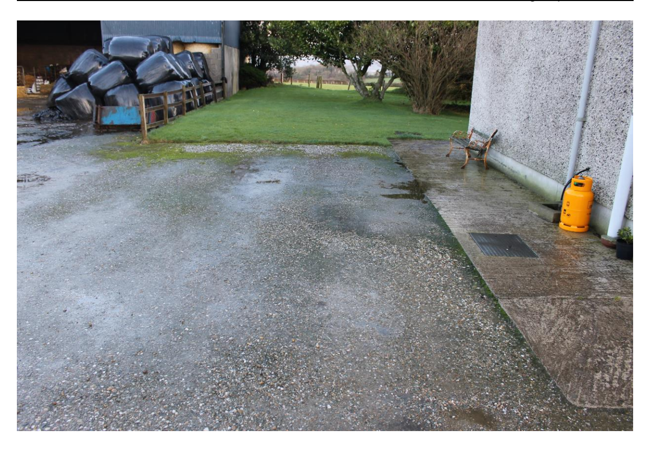
Plate 1: Area of the extension, looking north