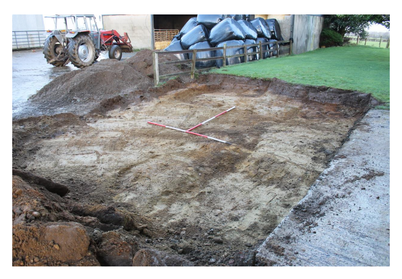
Plate 3: Trench 1, surface of the natural subsoil (c203), looking north-west