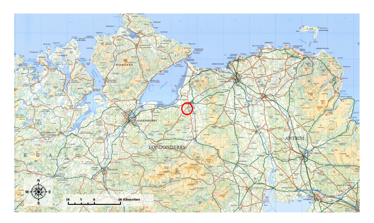
Figure 1: General location map with location of the site marked by the red circle