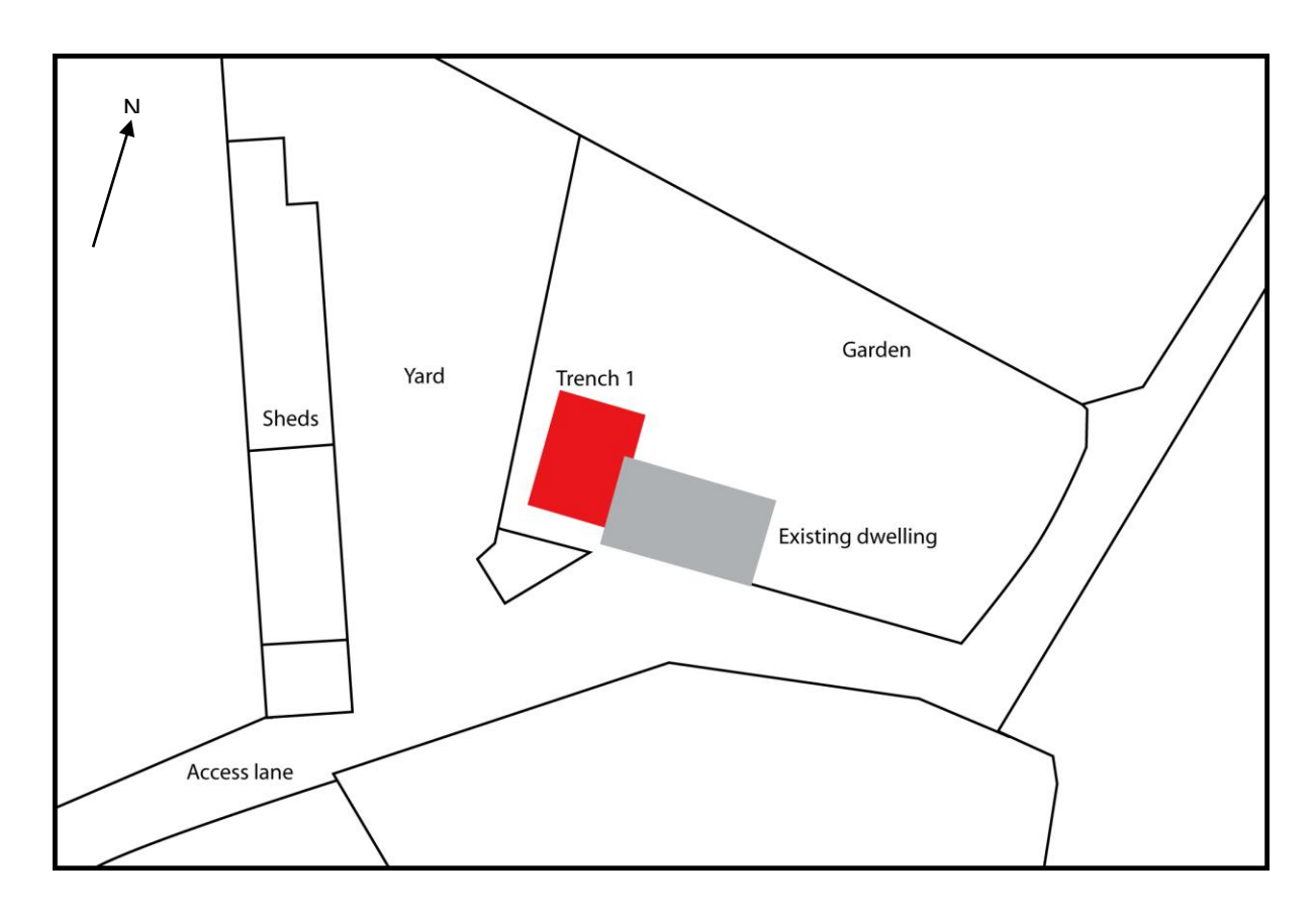
Figure 3 – Site plan showing locations of test trench (Scale 1:500)