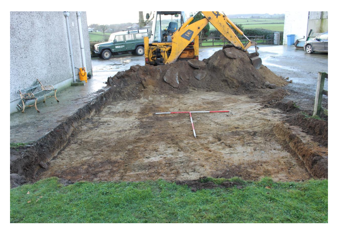
Plate 2: Trench 1, surface of the natural subsoil (c103), looking south