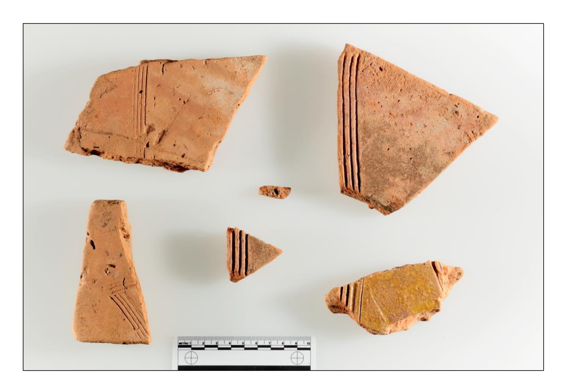
Plate 30: Example of tiles found in Area G