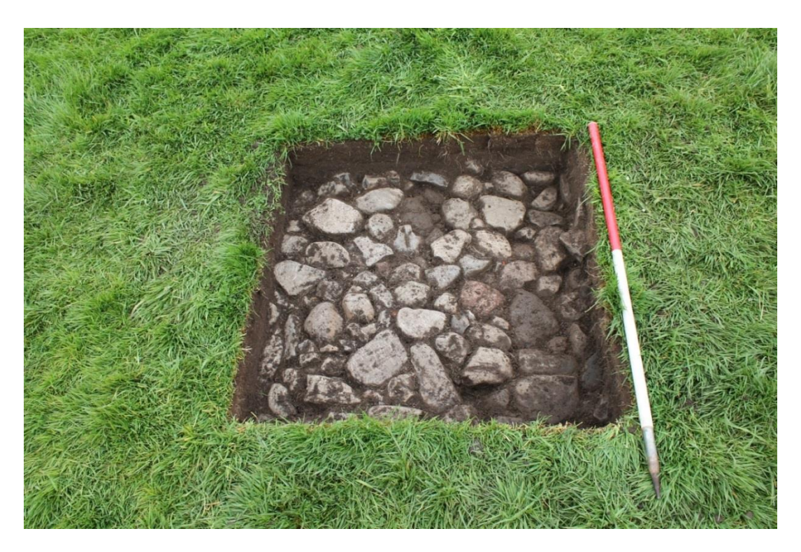
Plate 3: Trench 4, post-excavation showing cobbled surface 402 looking east