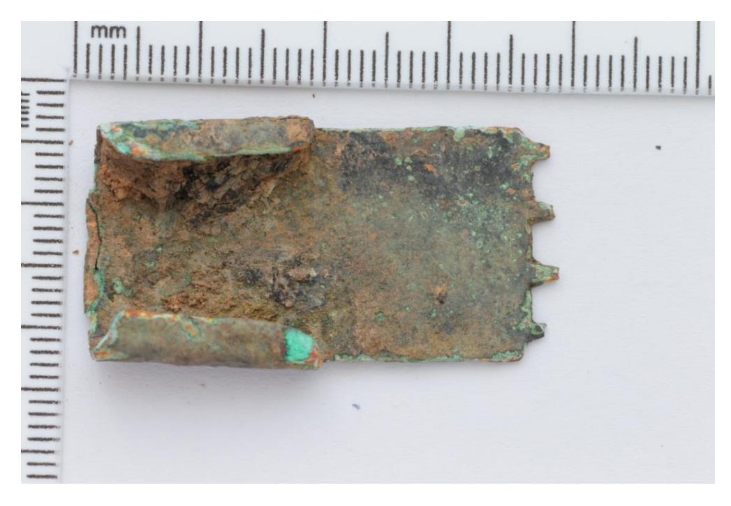
Plate 42: Trench 9b, copper alloy strap fitting - reverse