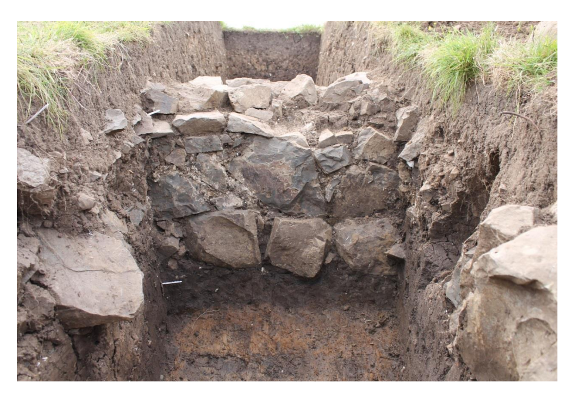
Plate 24: Trench 7, post-excavation, northern face of wall 703, looking south