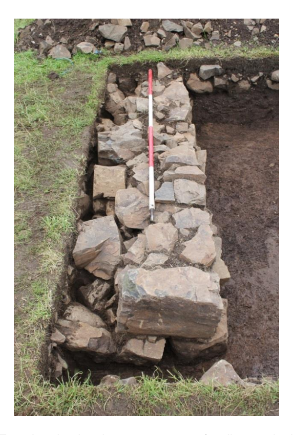
Plate 14: Trench 26b, showing eastern part of wall 2608, looking south