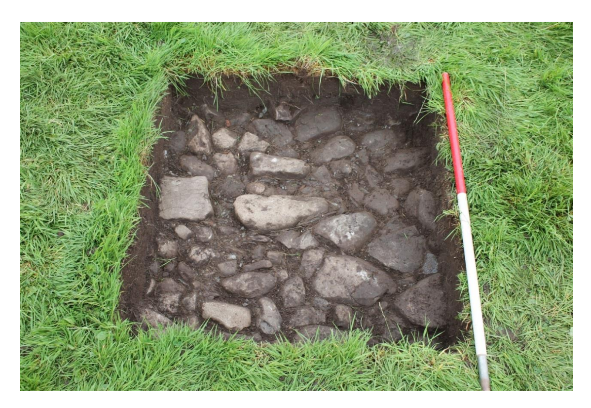
Plate 1: Trench 1, post-excavation showing cobbled surface 103, looking south