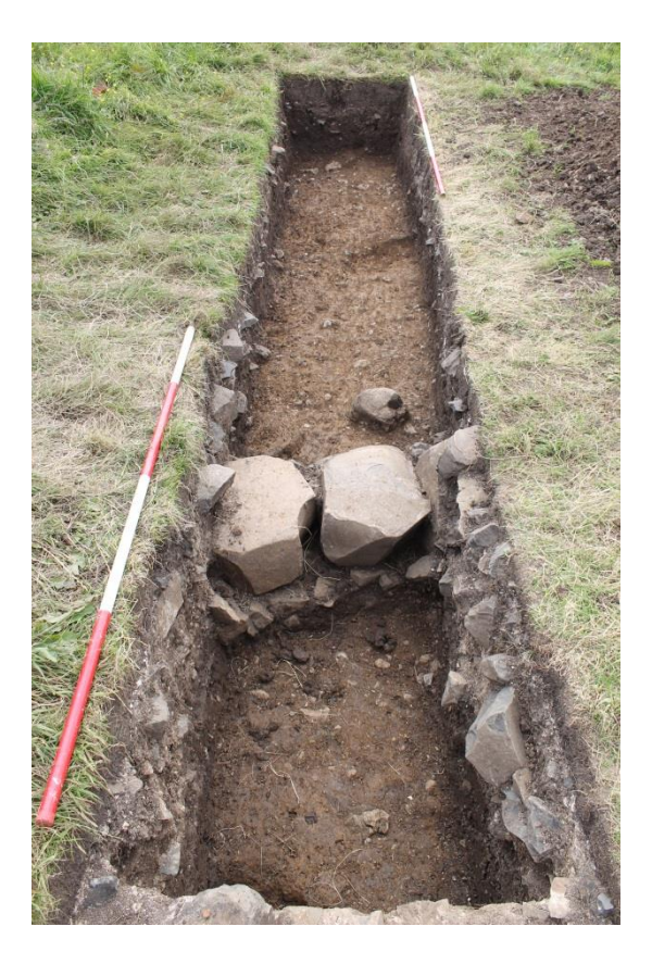
Plate 32 Plate 14 Trench 9a, drain feature 932, looking west