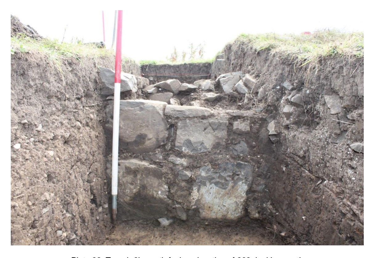
Plate 39: Trench 9b, north facing elevation of 903, looking south