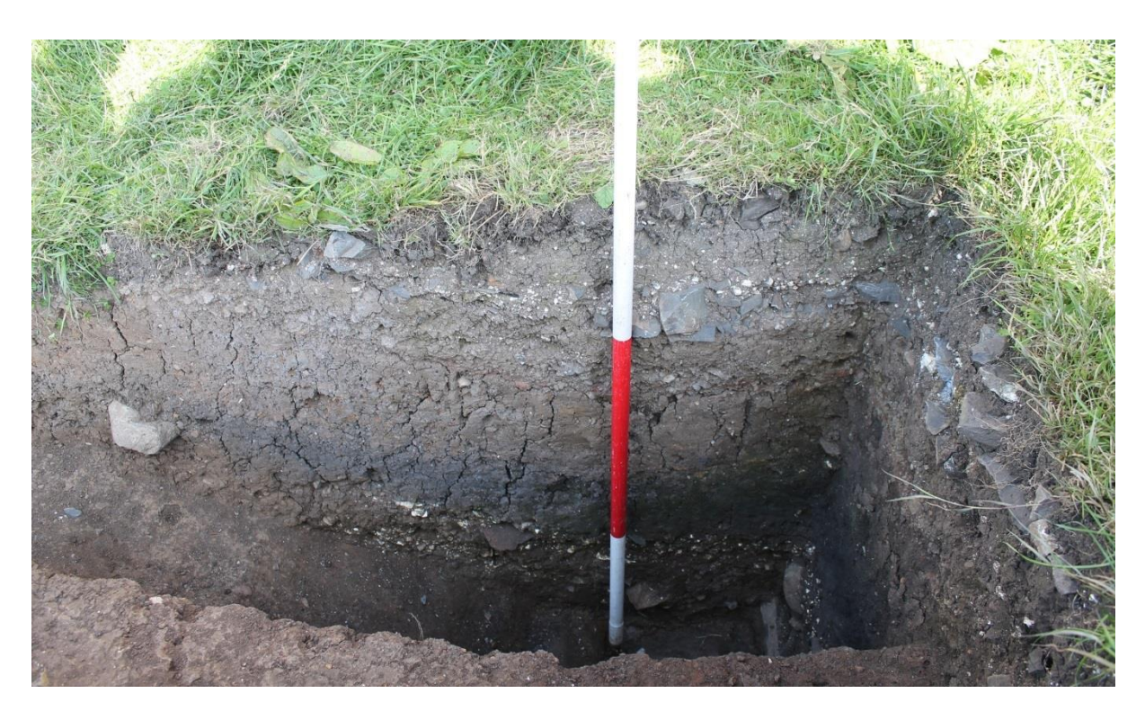
Plate 47: Trench 10, west facing section, southern part