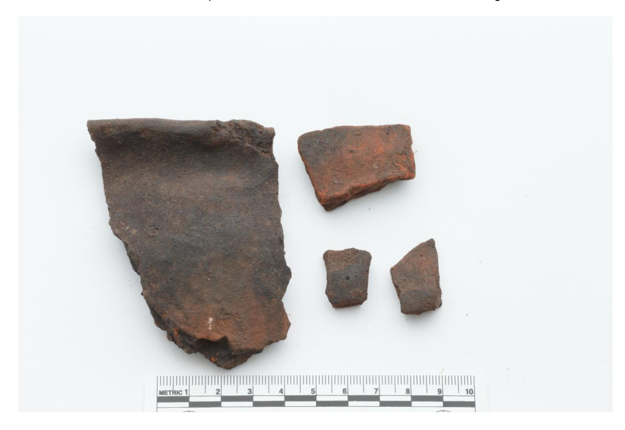
Plate 25: Trench 7 (714), Medieval Ulster Coarse Pottery