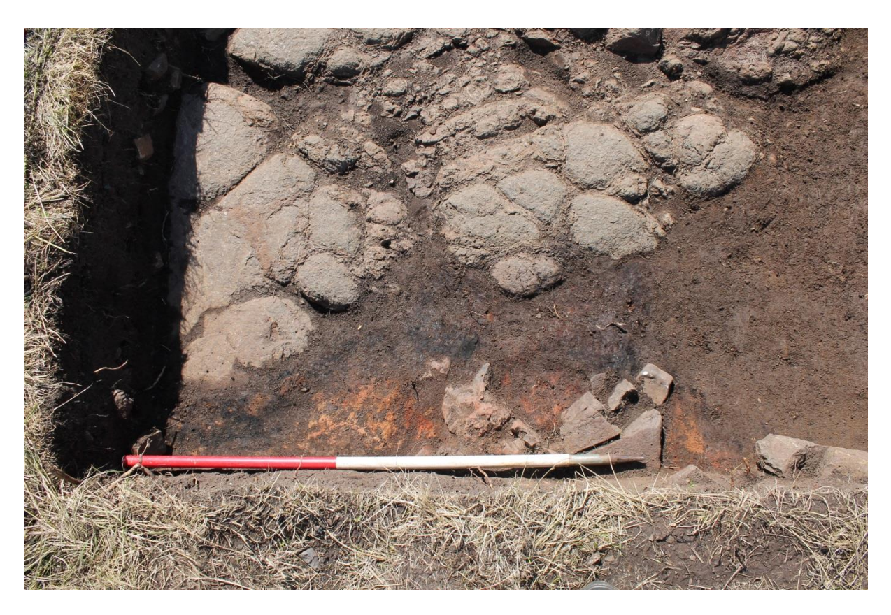
Plate 9: Trench 26a, surface of C.2804, in plan