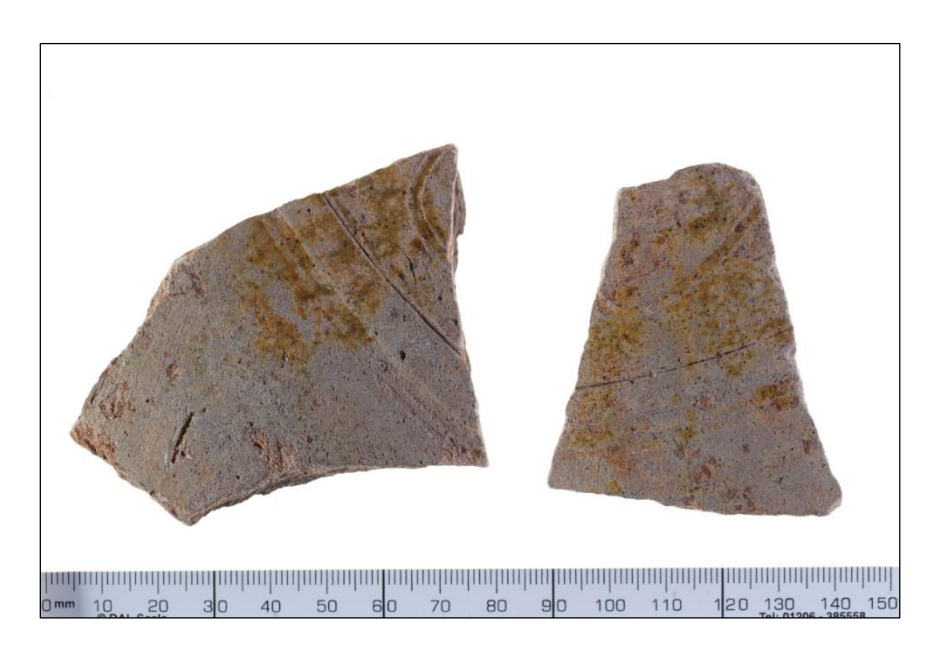
Plate 17: Trench 26b - Scottish Grey Ware