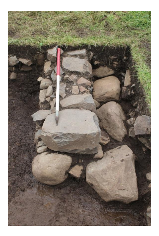
Plate 13: Trench 26b, showing northern part of wall 2608, looking west