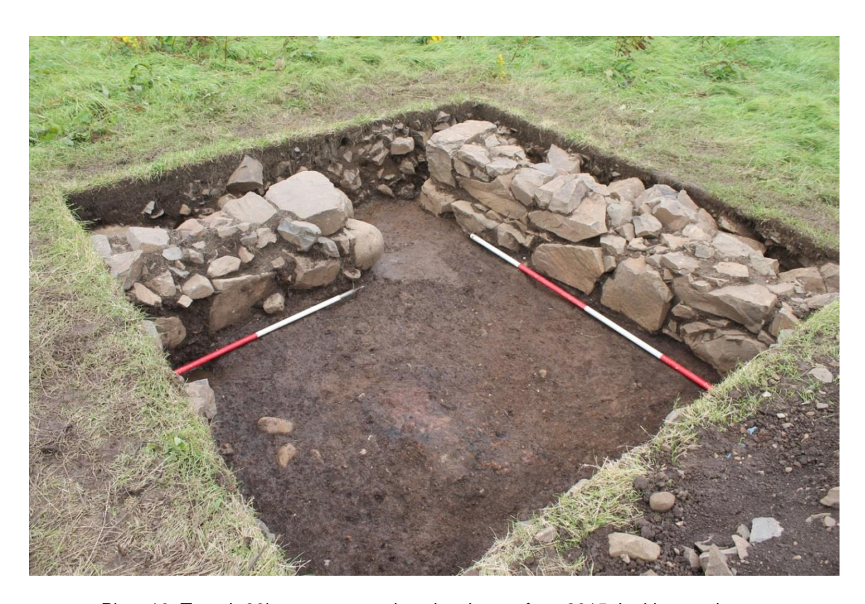
Plate 16: Trench 26b, post-excavation showing surface 2615, looking north-east