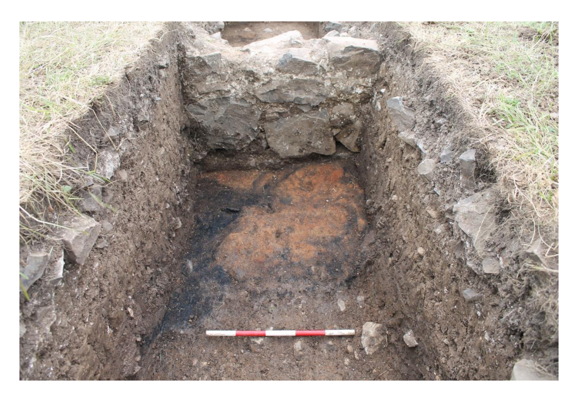
Plate 36: Trench 9b, showing C.916, C.917 and south of wall C.905, looking north