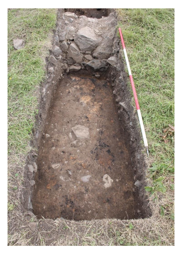
Plate 35: Trench 9b, orange brown charcoal deposit, looking south