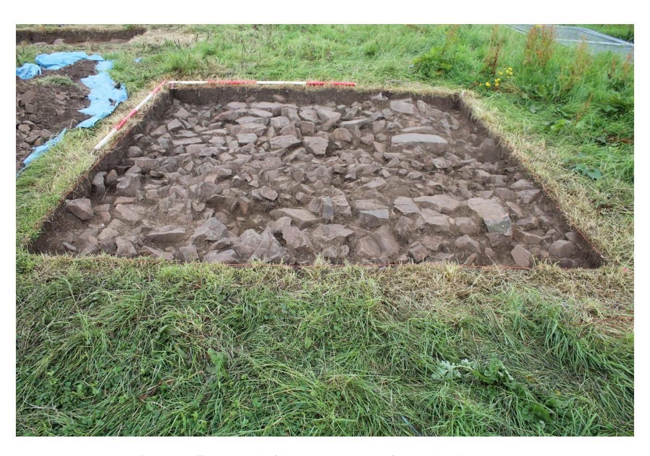
Plate 12: Trench 26b, following removal of 2601, looking west