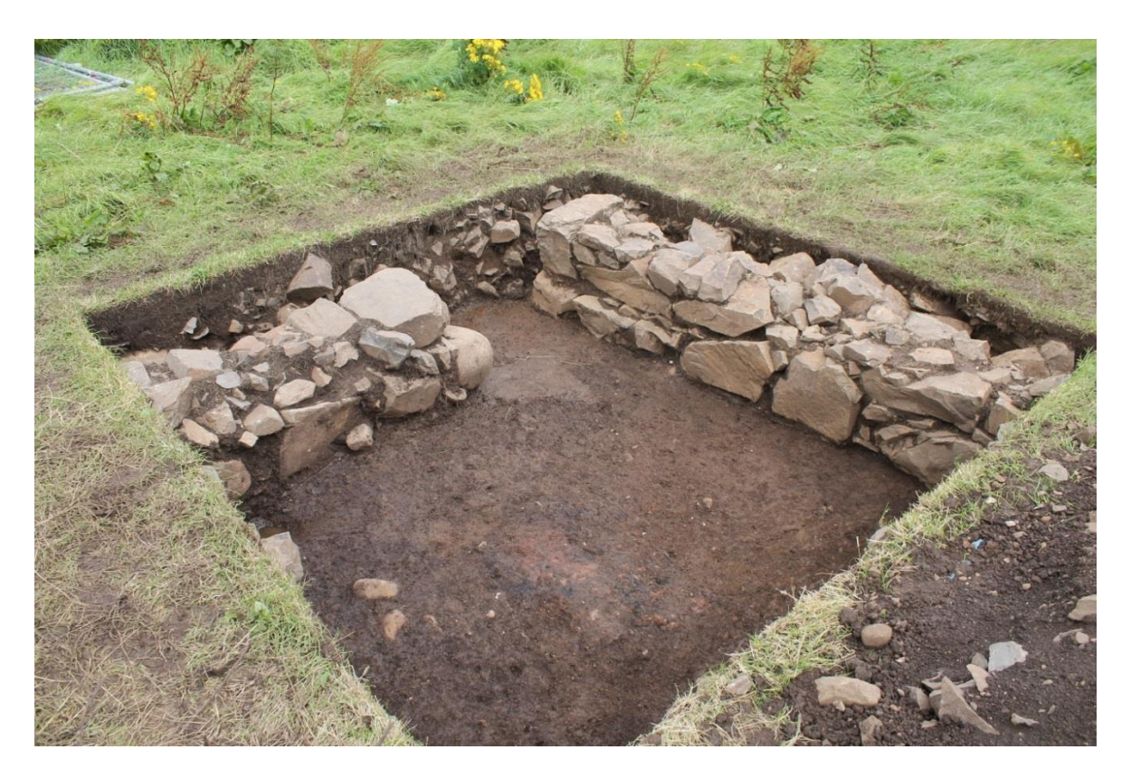
Plate 15: Trench 26b, post-excavation, looking north-east