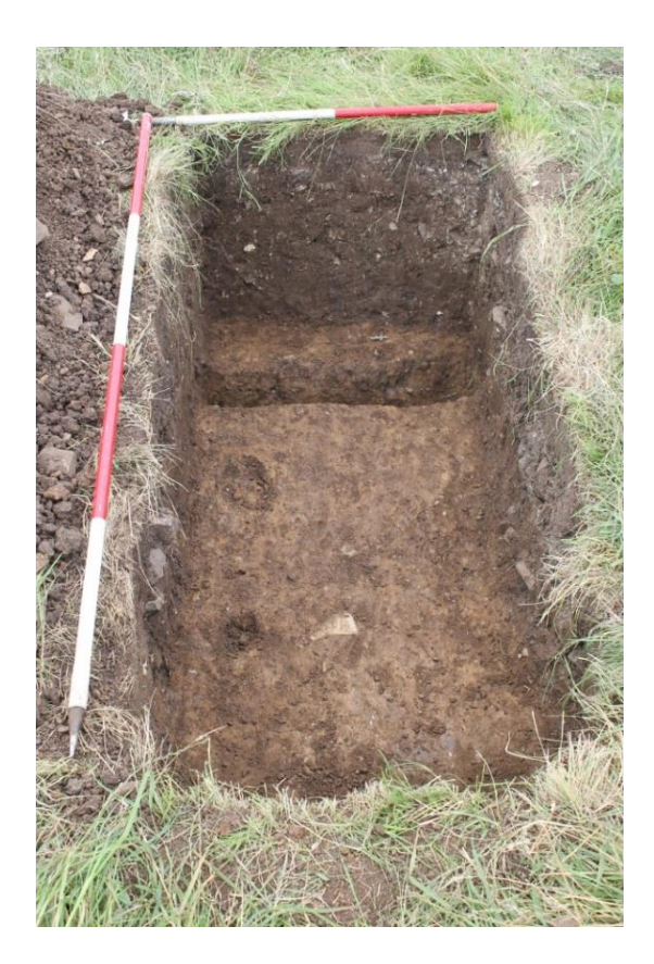
Plate 48: Trench 11, before extension, looking west