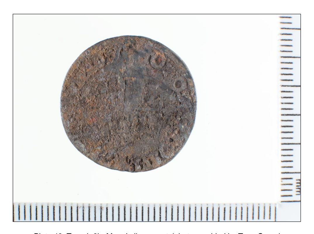
Plate 43: Trench 9b, Mary I silver groat