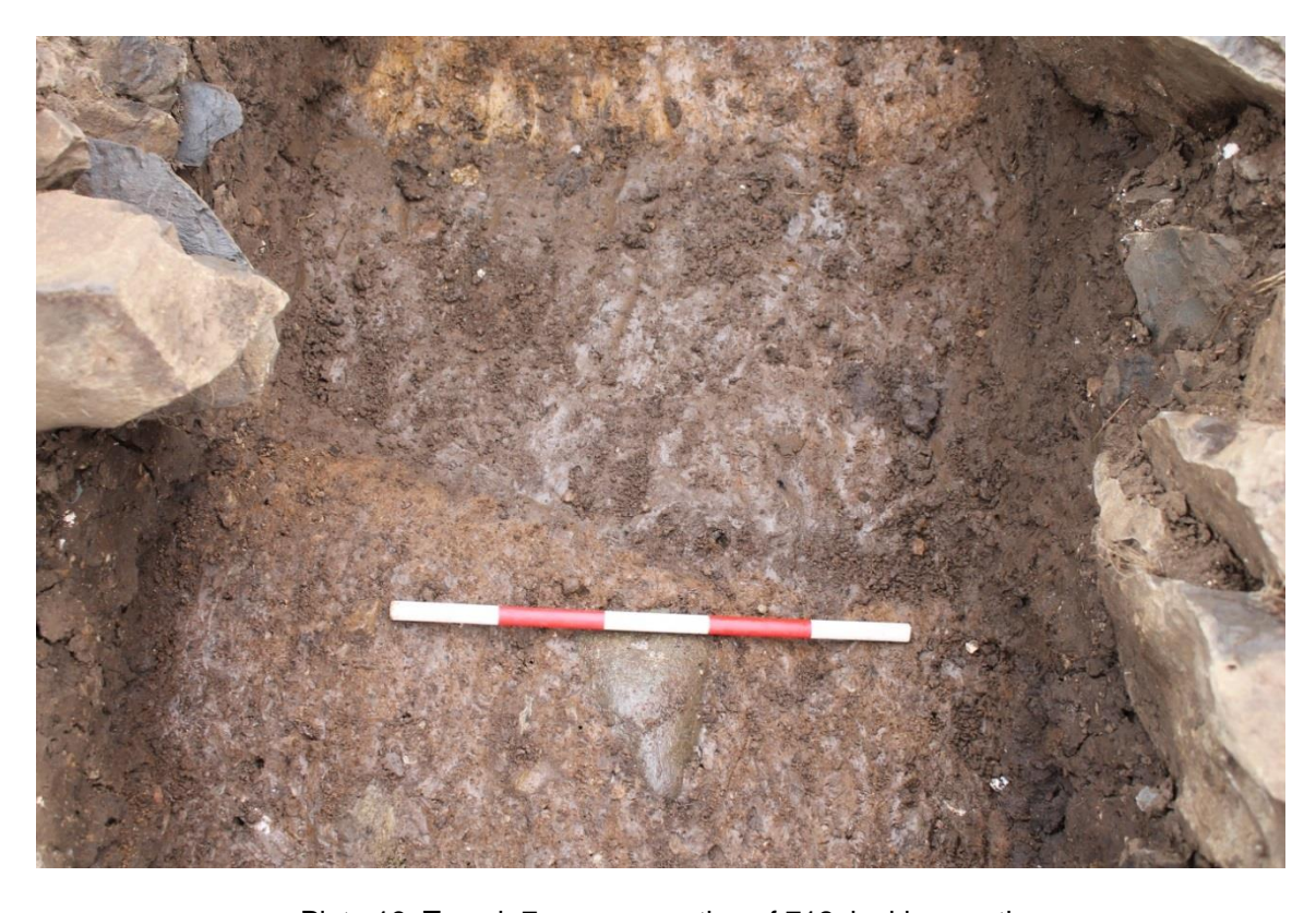
Plate 19: Trench 7, pre-excavation of 712, looking south