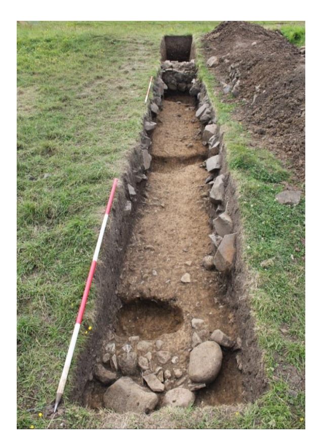
Plate 22: Trench 7, post-excavation, looking south