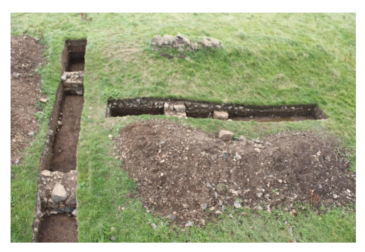
Plate 40: Trenches 9a and 9b, aerial shot, looking south