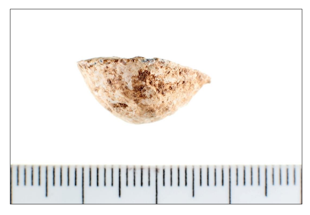
Plate 51: Trench 11, half musket ball