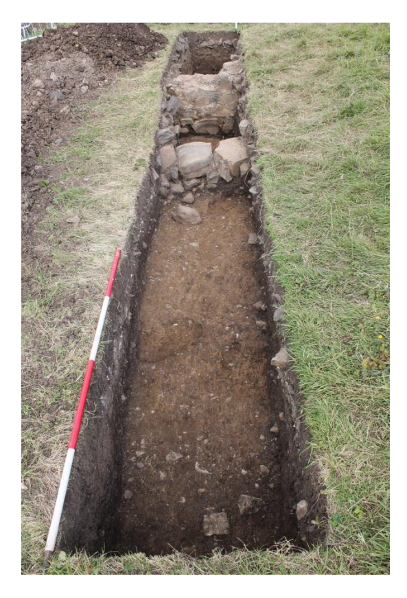
Plate 31 Trench 9a, western end of trench, looking east