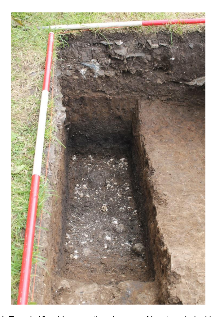
Plate 44: Trench 10, mid-excavation close up of box trench, looking south