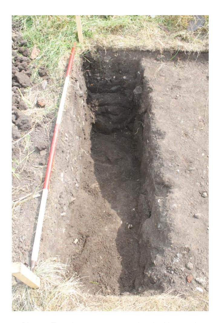
Plate 6: Trench 29, post-excavation, looking north