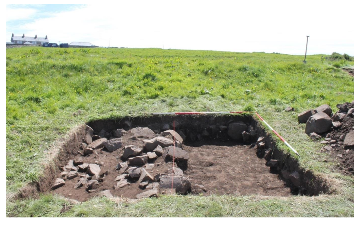
Plate 27: Trench 8, half section through 802, looking south