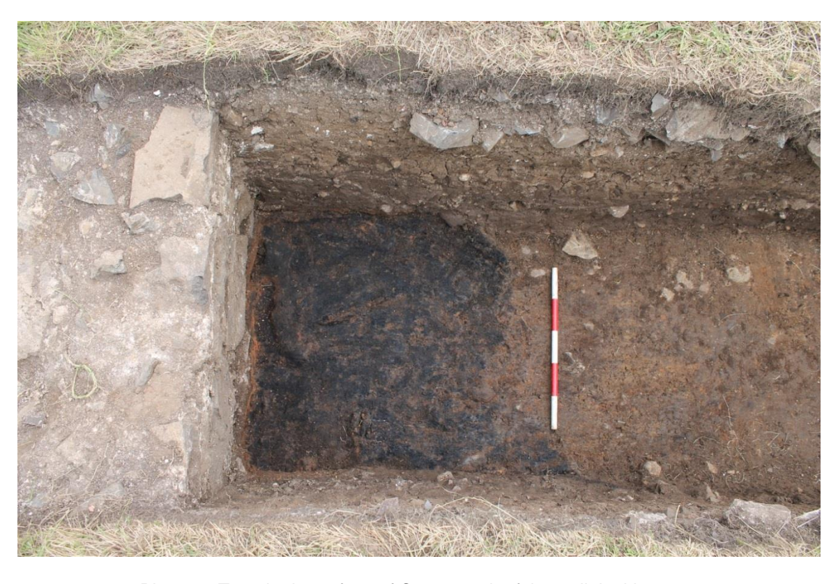
Plate 37: Trench 9b, surface of C.917 south of the wall, looking east