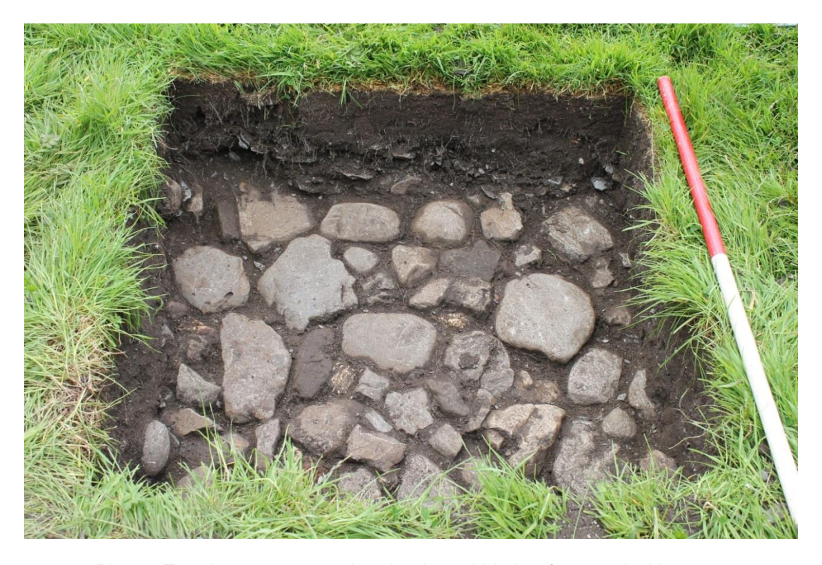
Plate 2: Trench 2, post-excavation showing cobbled surface 203 looking west