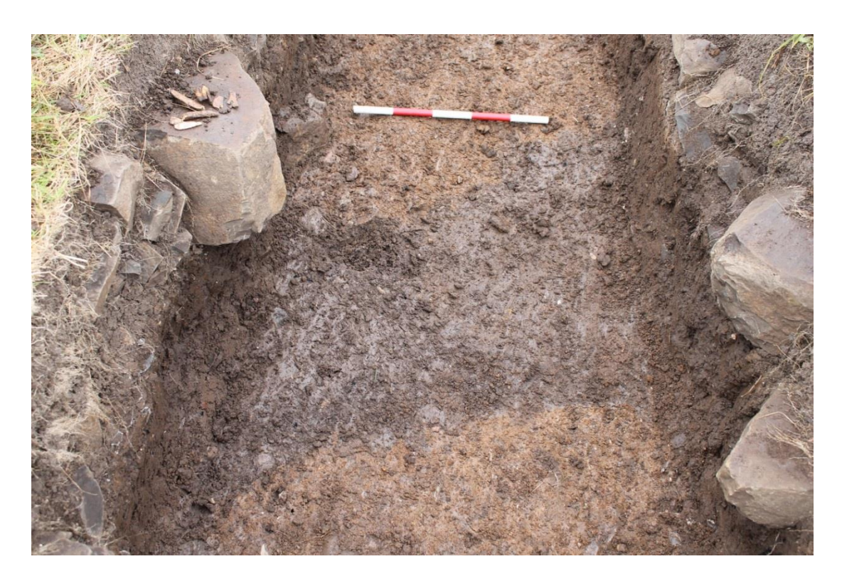
Plate 18: Trench 7, showing surface of 714 and cut 713, looking north