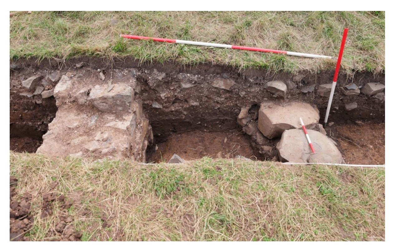
Plate 34: Trench 9a, showing two elevated features, 928 and 932