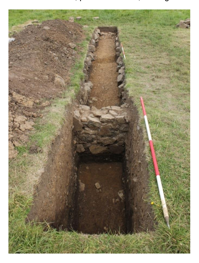
Plate 23: Trench 7, post-excavation, looking north