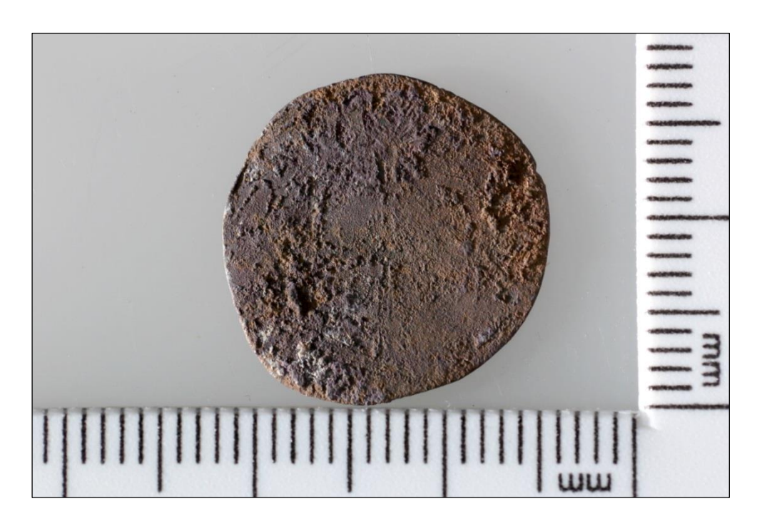
Plate 52: Trench 11, Elizabeth I silver coin