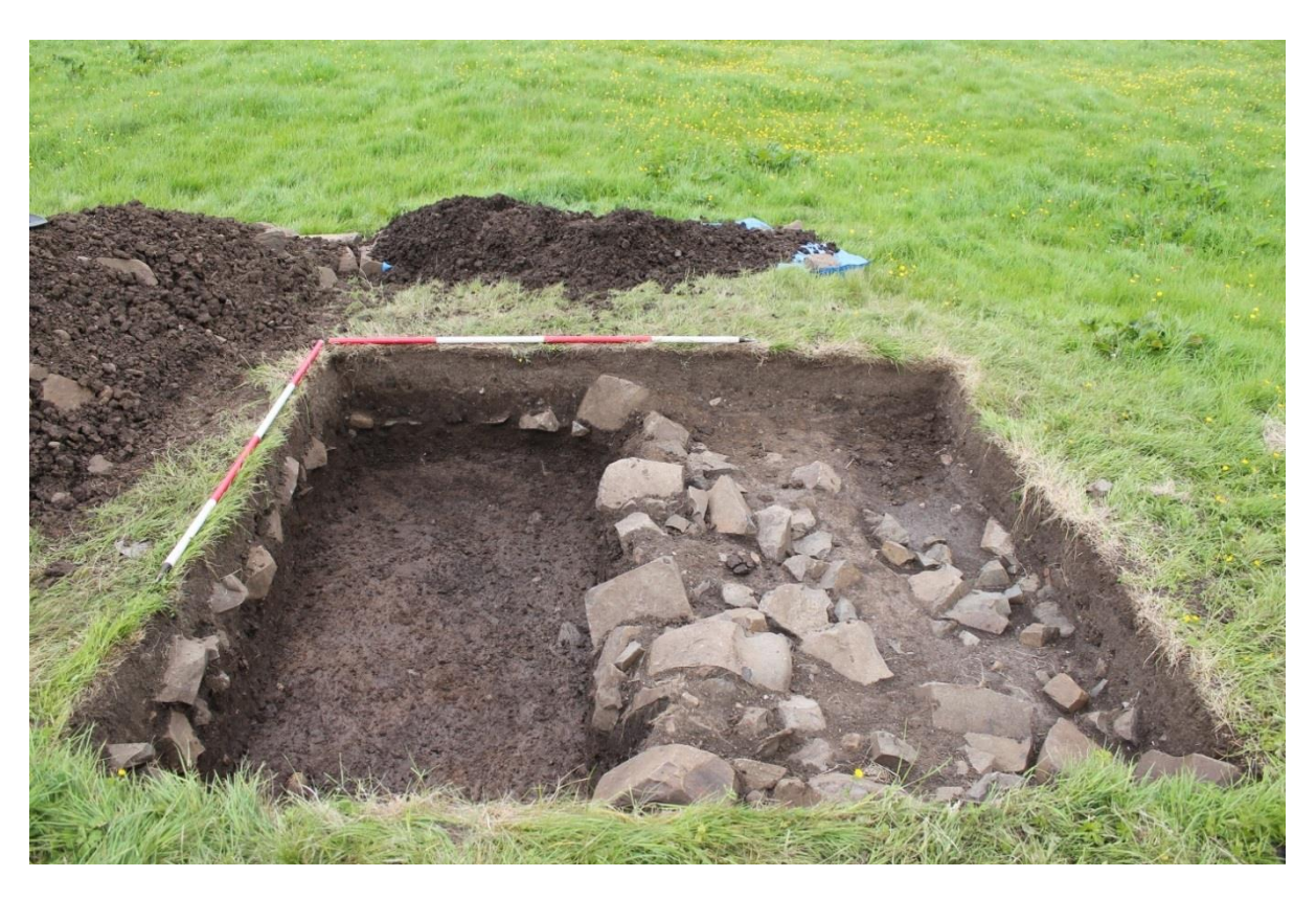
Plate 28: Trench 8, half section following removal of 804, facing north