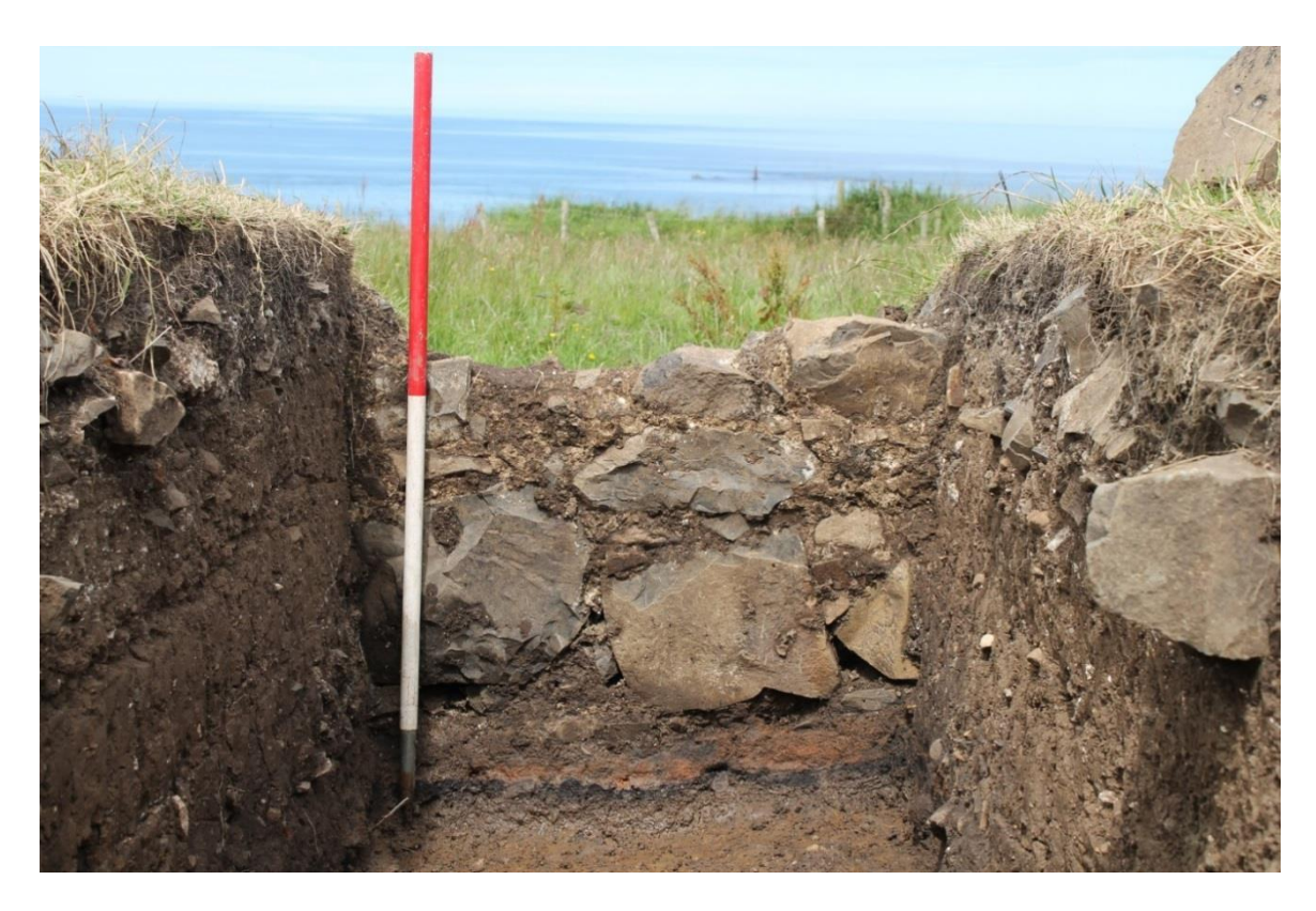
Plate 38: Trench 9b, south facing elevation of 905, looking north