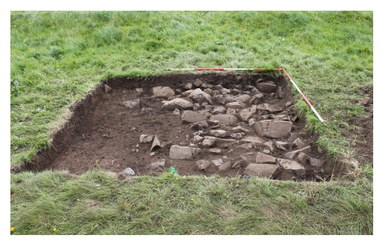
Plate 26: Trench 8, showing 802, looking south