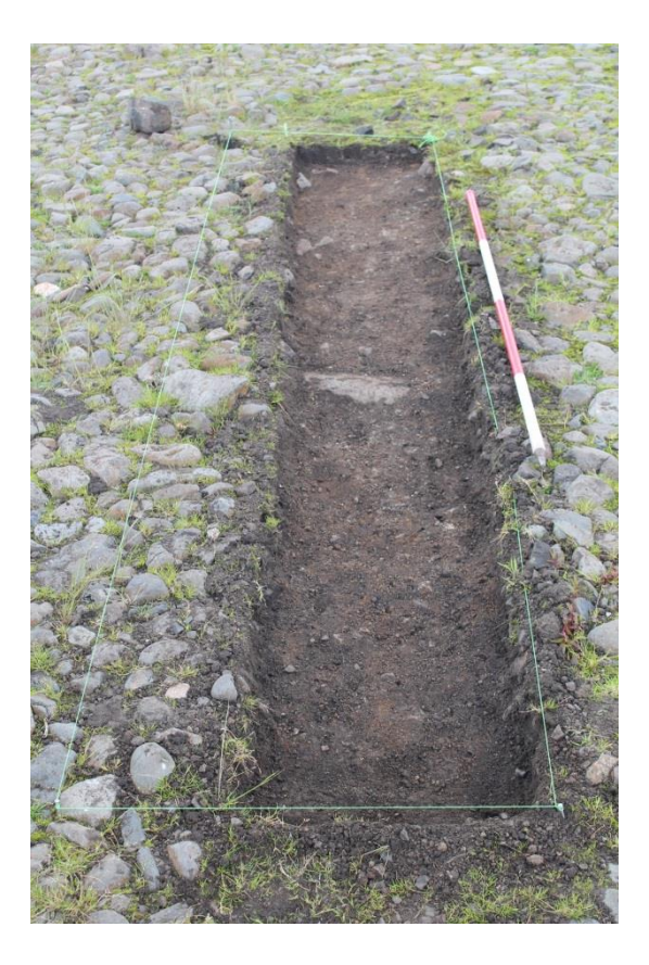
Plate 4: Trench 5, prior to removal of cobbles, looking south-east