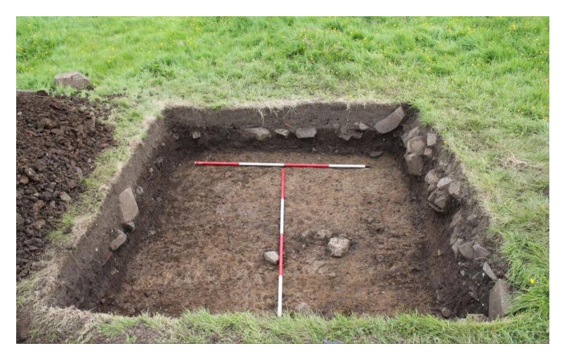
Plate 29: Trench 8, following removal of 802, looking south