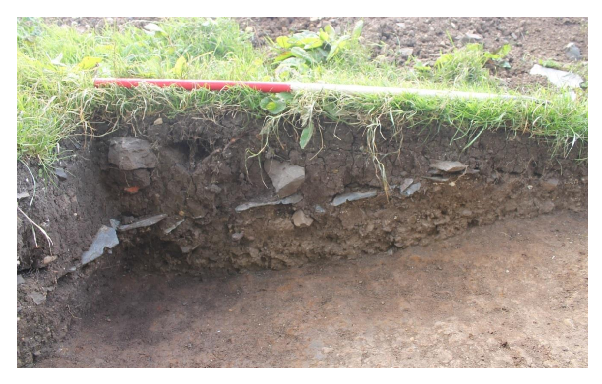
Plate 46: Trench 10, east facing section, southern part