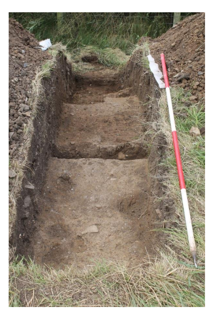
Plate 50: Trench 11, post-excavation of extension, looking west