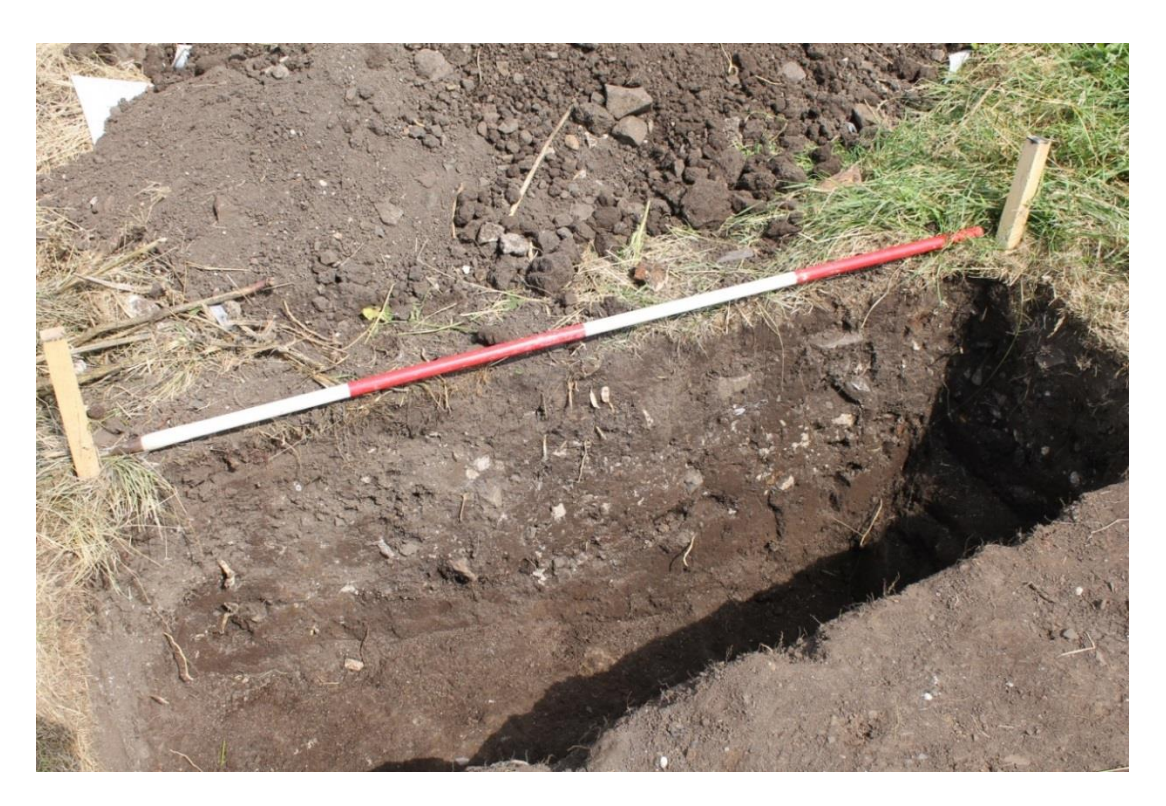
Plate 7: Trench 29, post-excavation showing west facing section