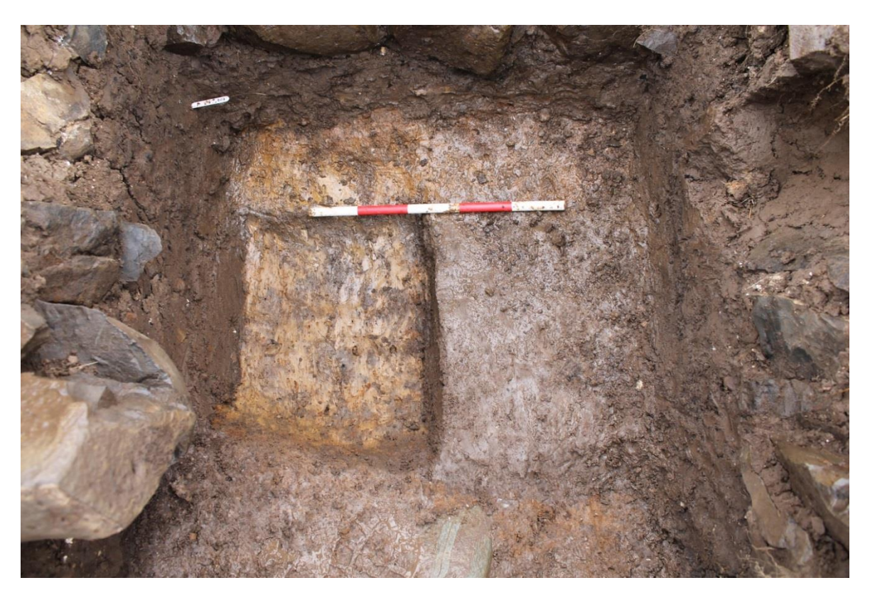
Plate 20: Trench 7, mid-excavation of 712, looking north