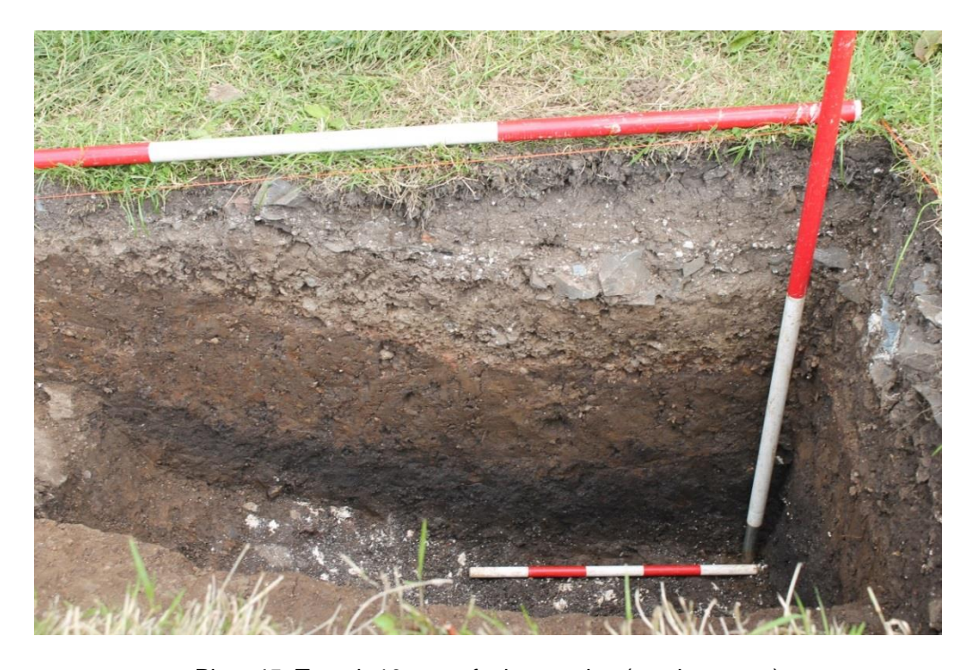
Plate 45: Trench 10, west facing section (southern part)