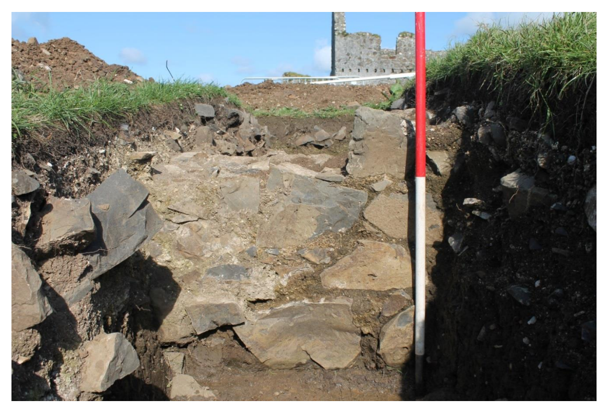
Plate 33: Trench 9a, west facing elevation of 928