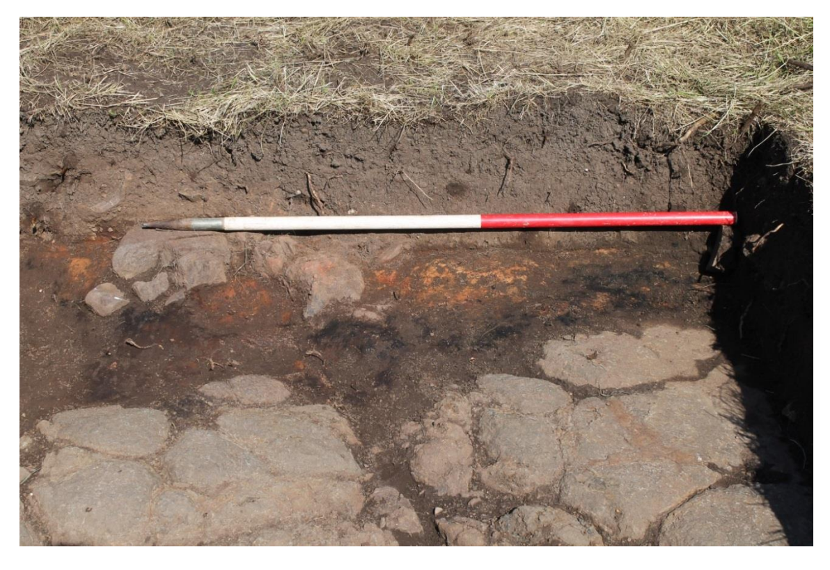
Plate 8: Trench 26a, surface of 2604, looking north