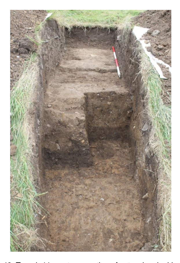
Plate 49: Trench 11, post-excavation of extension, looking east