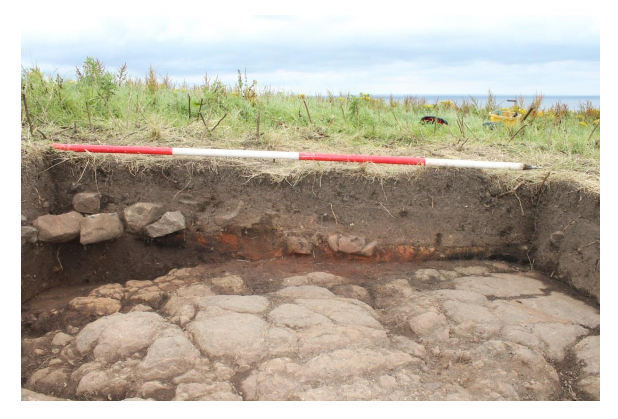
Plate 11: Trench 26a, south facing section