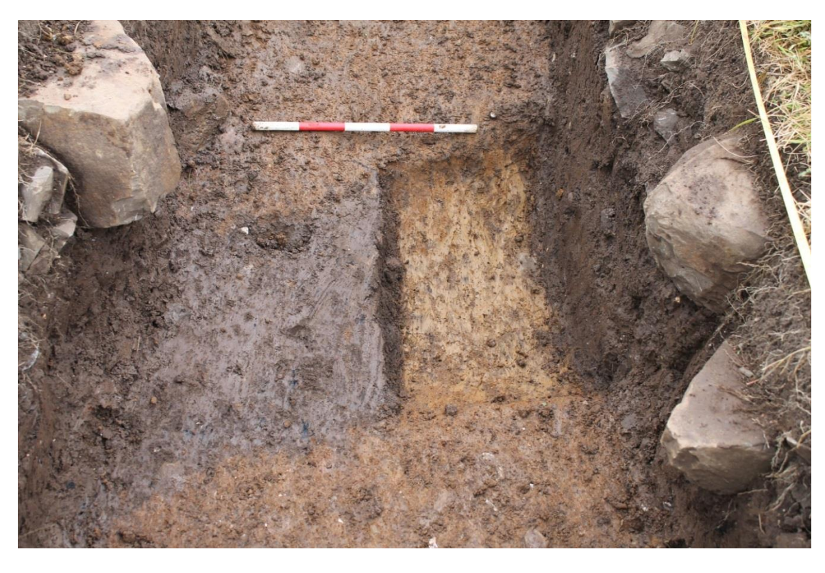
Plate 21: Trench 7, mid-excavation of 714, looking north