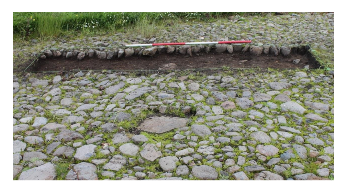
Plate 5: Trench 5, west facing section through 501