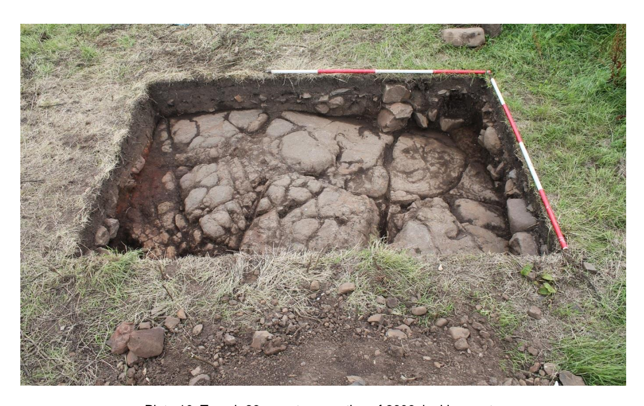
Plate 10: Trench 26a, post-excavation of 2606, looking east