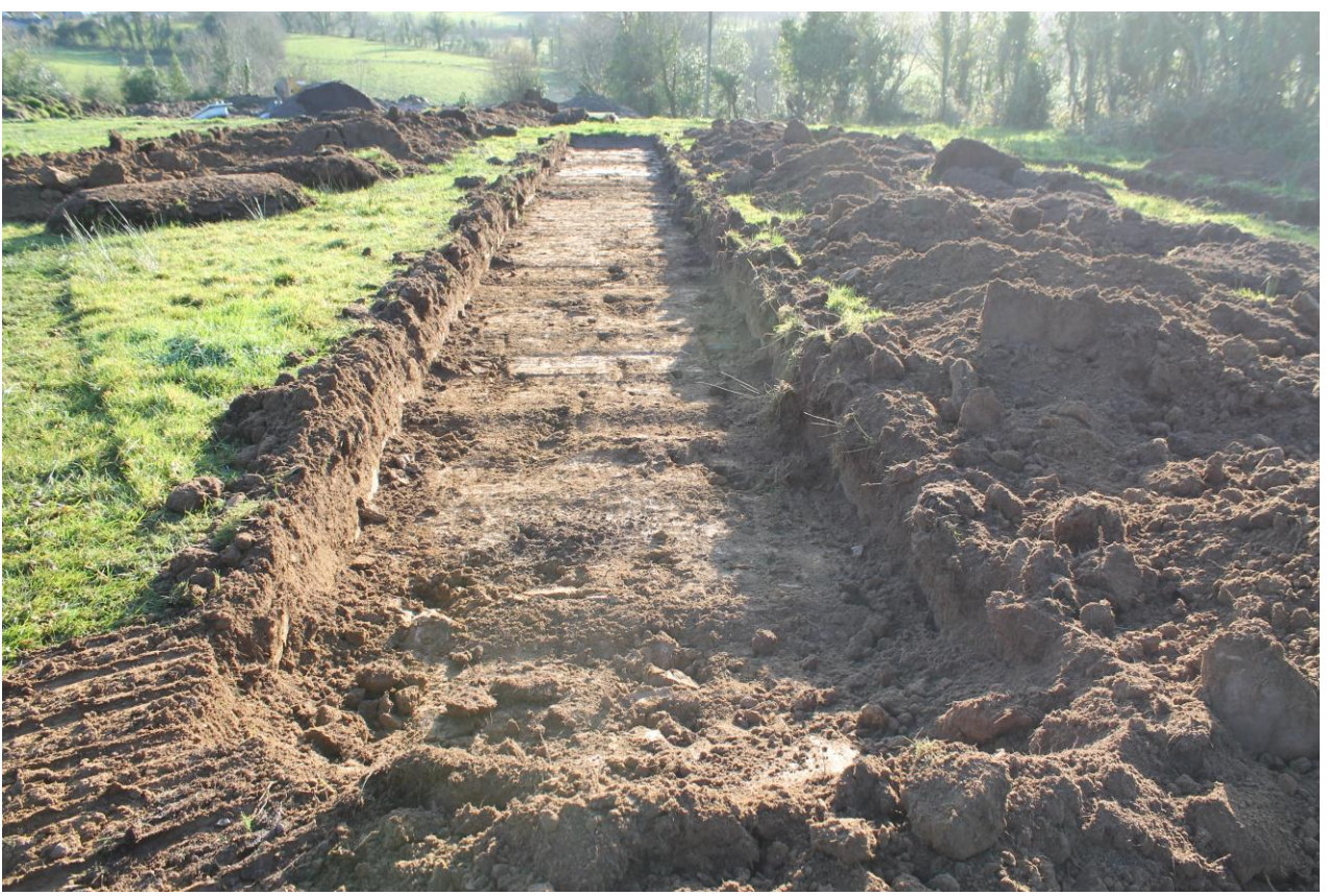
Plate 3: Trench 2, post-excavation, looking south-east.