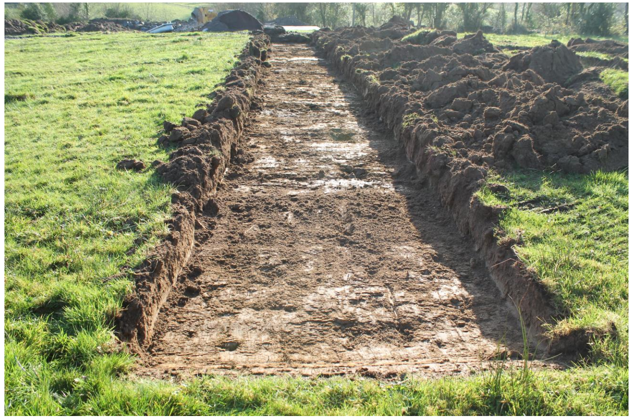
Plate 4: Trench 3, post-excavation, looking south-east.