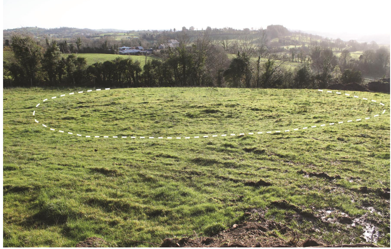
Plate 1: FER 191:101, with approximate outer limits highlighted, looking south-east.