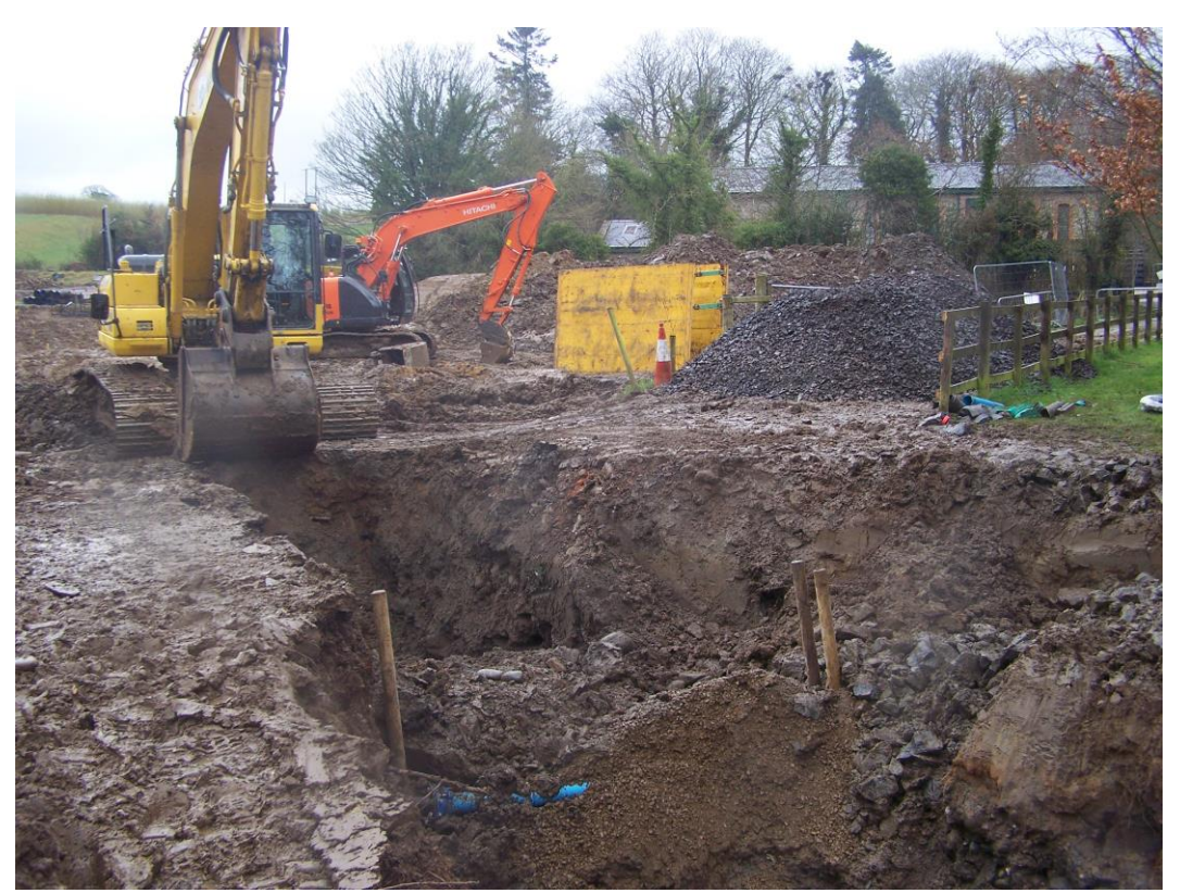
Plate 5: Pipe trench crossing path, with former mill building (now Green Lane Museum) in background to right (looking south-west).