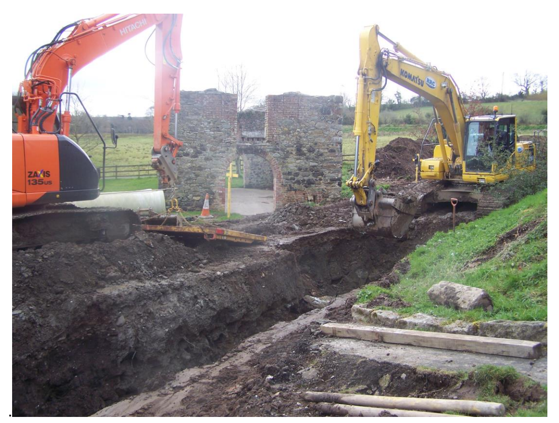
Plate 3: Pipe trench passing beetling mill, with former bleach green in background (looking south-east).