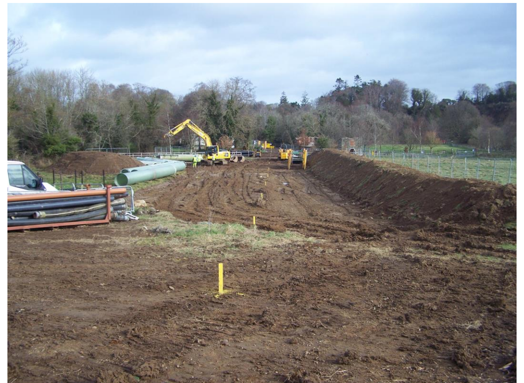
Plate 1: Line of pipe trench, marked by yellow posts, pre-excavation with bleach green at right of photo (looking north-north-east).