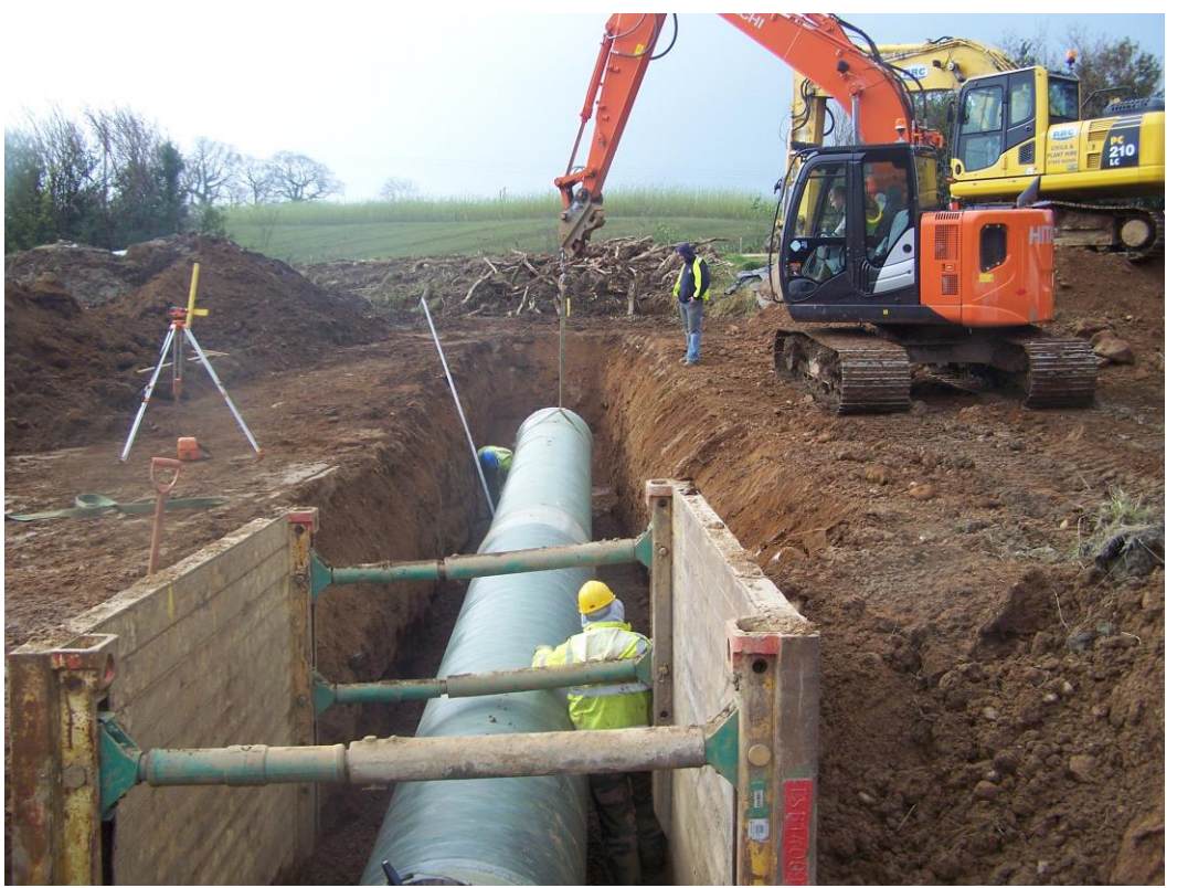
Plate 7: Last section of pipe trench, with section of pipe being put in place (looking south-south-west).