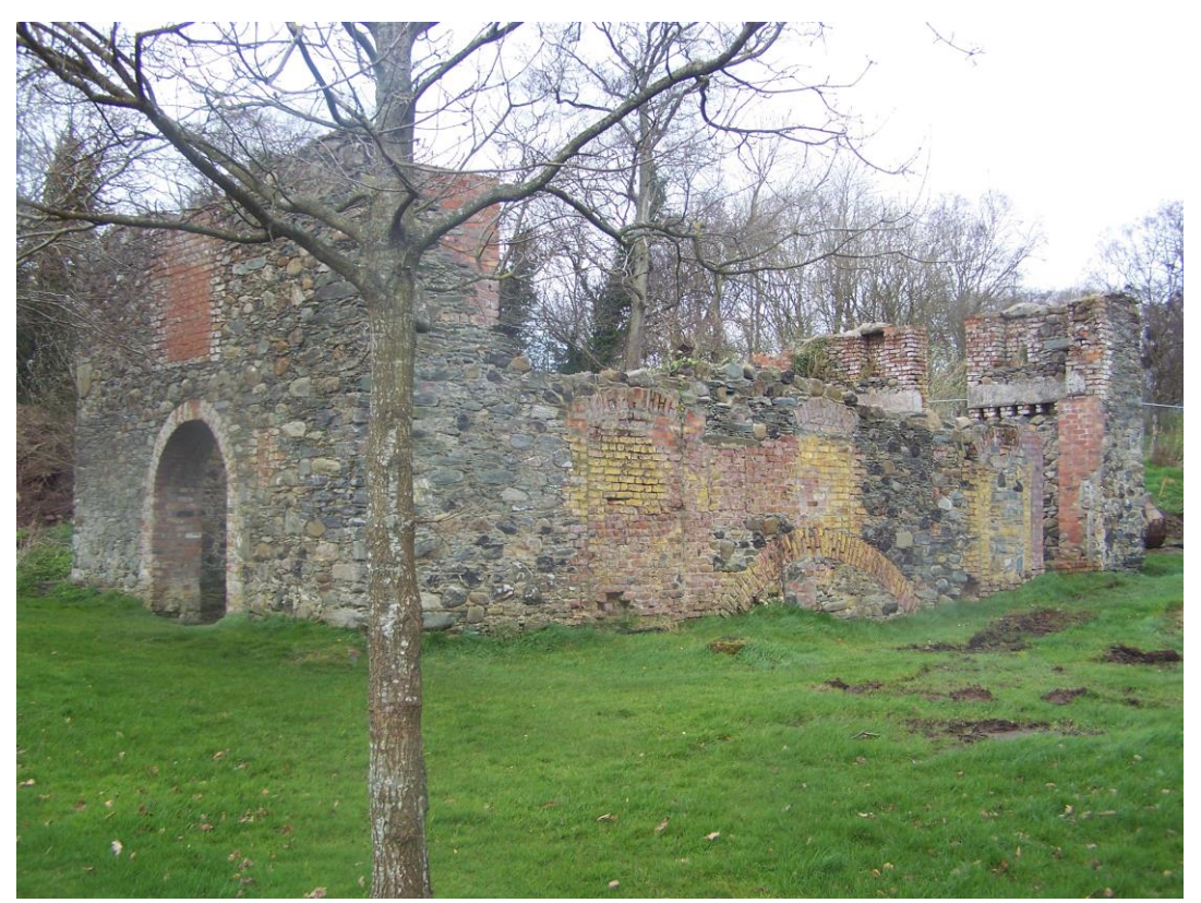
Plate 2: Beetling mill (looking west).