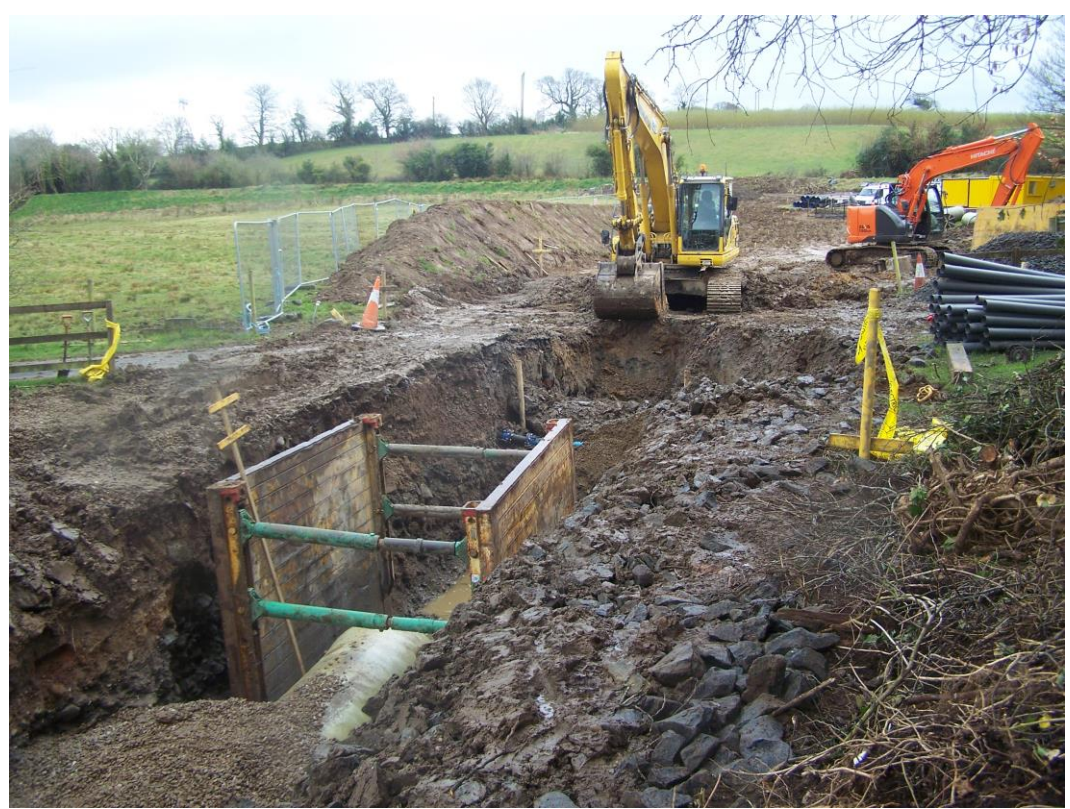
Plate 6: Pipe trench crossing path, with former bleach green to left (looking south).