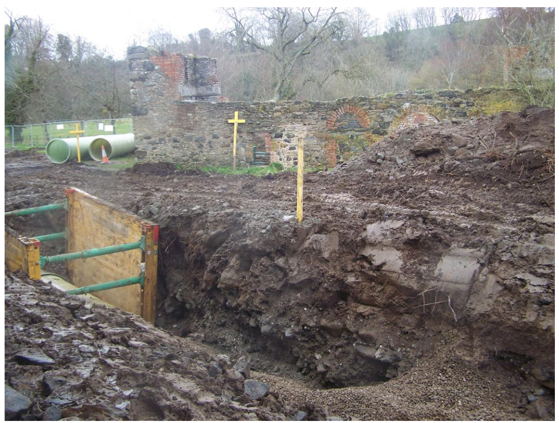
Plate 4: Pipe trench passing south-west facing side of beetling mill (looking northeast).