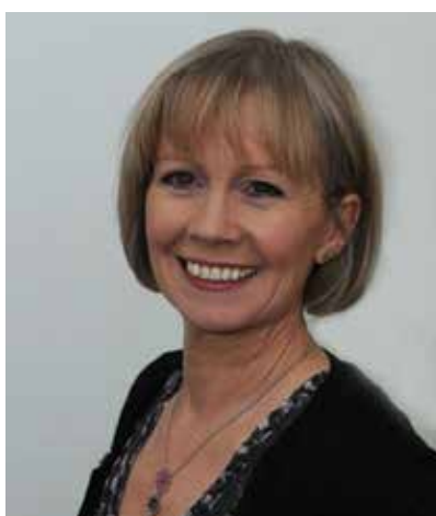
Dr Bronagh Blackwood

The federation comprises a Council of 26 representatives from National Associations across Europe representing approximately 25,000 European critical care nurses. Its mission is to promote collaboration and equity among the national critical care member associations in order to improve nursing care of critically ill patients and their families.