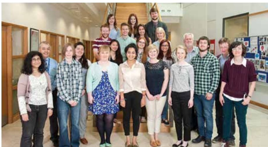
Students from the CCRCB Summer Studentship / Research Programme 2014