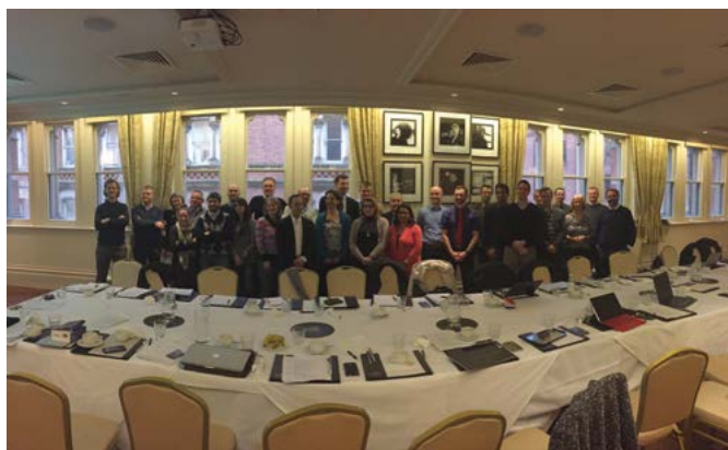
A number of academic and research staff from CCRCB attended a meeting of the Belfast-Manchester Movember Centre of Excellence Team, held in Manchester on 4 February 2016, World Cancer Day.