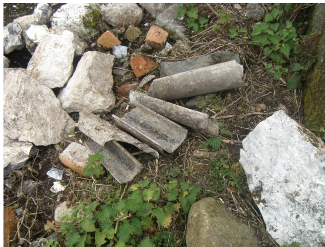
Examples of asbestos guttering. Centre for Archaeological Fieldwork

One substance, asbestos, is worthy of particular mention. Asbestos is a naturally-occurring mineral, of which three types were in common use during the twentieth century before its harmful effects were understood. These are Blue asbestos (crocidolite), Brown asbestos (amosite) and White asbestos (chrysolite). Archaeologists will probably encounter white asbestos most frequently, as it has been widely used in the building industry to make roofing tiles, corrugated roofing sheets, gutters, drainpipes and flues. In these types of product, the asbestos fibres are bound into a cement matrix and are relatively harmless if the product is not disturbed.