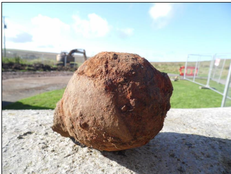
Live mortar shell. National Trust

If unexploded ordnance is encountered at an archaeological site, everyone should be evacuated from the area, bearing in mind there may be no minimum safe distance. The police should immediately be informed and will assume control of the area until it is declared safe.