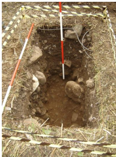
Low-level hazard tape presenting a trip hazard

There are many items at an archaeological site that present trip hazards. These include grid pegs, measuring tapes, string lines and tools and other equipment lying around. To minimise such hazards, unused tools and equipment must be regularly removed from the work area and tape lines and strings that need to be maintained in place for long periods must be marked with high-visibility tape or otherwise fenced off. Care must be taken when using hazard tape in order to prevent the tape itself becoming a hazard. Such areas should be marked at waist height.