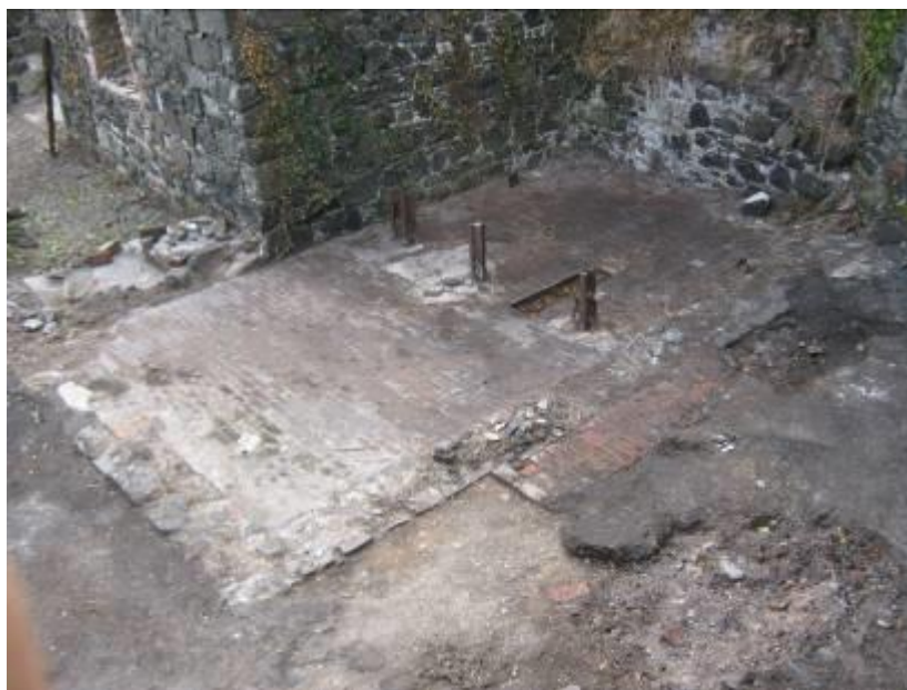
Post-excitation view of the retort area of a domestic gasworks. National Trust

In another example, early tanneries were renowned for the noxious odours produced and for this reason were often located on the outskirts of towns. The smell was mainly due to large quantities of urine, animal faeces and decaying flesh present on these sites. More modern tanneries used chemicals such as sodium sulphide and sodium hydroxide, as well as salts, acids and various other minerals and chemical compounds, which can remain at harmful levels in the soils at these sites.